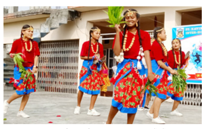
Inter-house dance competition at SXS