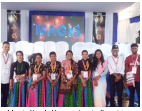
St. Xavier's Parish Youths, Maheshpur at Magis Youth Convention in Ranchi