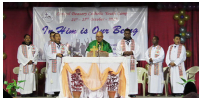
Nepal Catholic Youth Convention