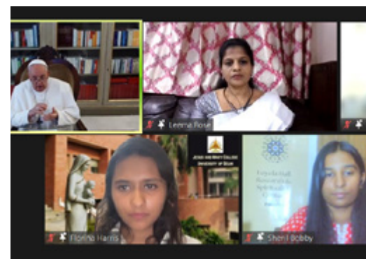
Online meeting with the Pope