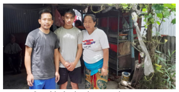
One of the families that received rations