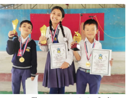
Three super star singing finalists