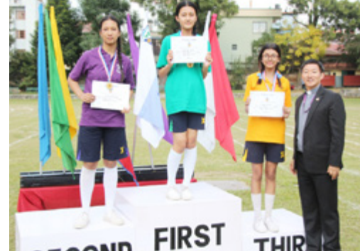
Cls. 11 & 12 sports day