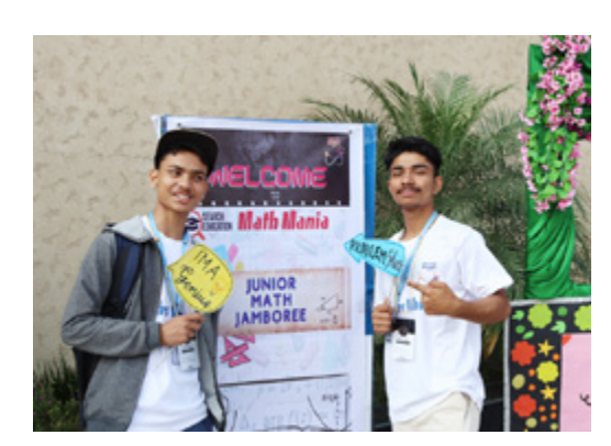
Maths Mania event in the college