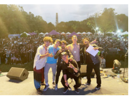
Kanchi Mayalu Band of the College

s the long-awaited was caround the corner, the students seemed to have a bounce in their steps. We witnessed a number of intellectual and artistic performances during that time. The A-level students conducted a quiz competition, and Plus 2 conducted Maths Mania as per their annual tradition. The Physics department conducted 'quantum espresso', a crash course on quantum mechanics. Kanchi Mayalus, a band of students from the College emerged victorious in the Ace Expression Inter-College Band Competition. As the Dashain came closer, the students' committee proposed to conduct the Dashain celebration. They organized food stalls, and rangoli competitions