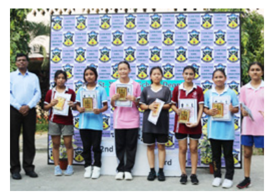
Plus 2 mini-marathon girls runners-up