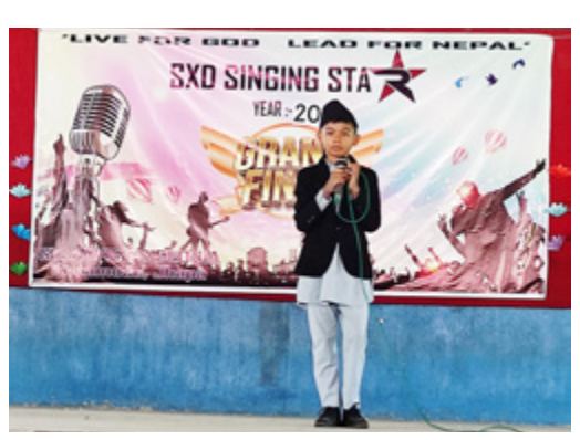
Budding super star singer