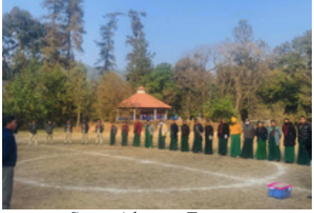
Scout Advance Training