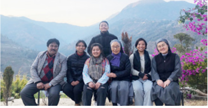
IMCS members with St. Paul Sisters in Gyalthung