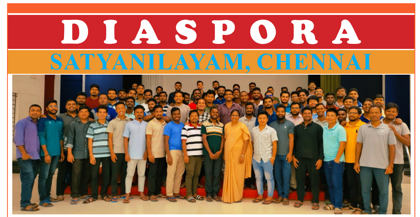
Scholastics with other students of Satya Nilayam Research Institute of Philosophy and Culture

The new year 2023 unfolded with lots of pleasure and cheerfulness. We began the year with thanksgiving Holy Eucharist. This month was filled with lots of intellectual activities such as seminars, workshops, and other events.