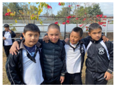
Good friends enjoy companionship