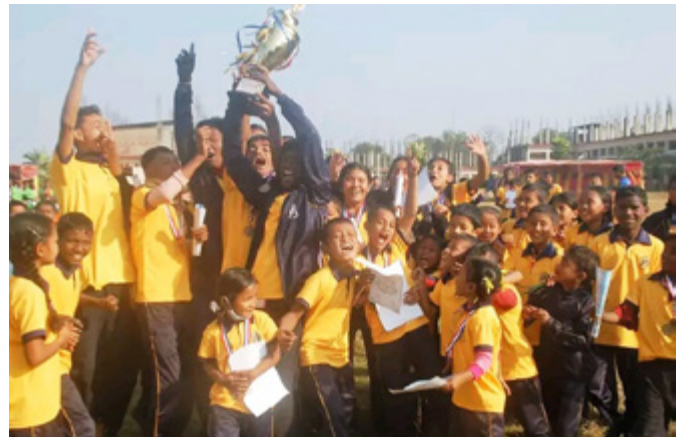
Yellow House celebrates school championship