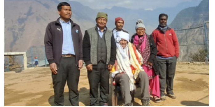
A CVC volunteer gets farewell