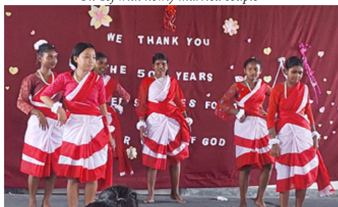
Ignatius Day celebration