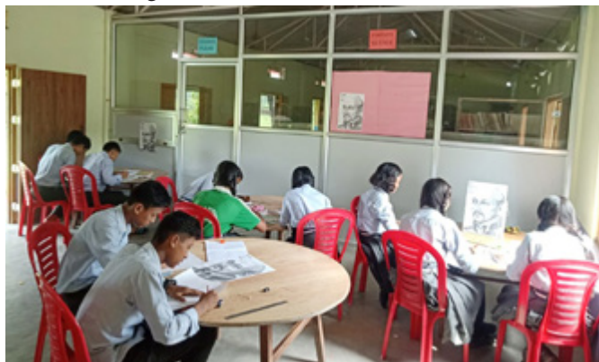
Drawing competition on St. Ignatius