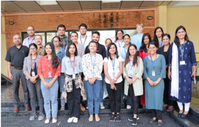
Participating members of Divine Project