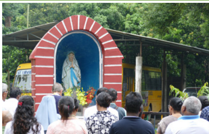
Blessing of Grotto with Religious & Clergy of Eastern Nepal

Arrupe House, Deonia, is in 'dehat', village territory. The month opened with our farming neighbours preparing their fields for rice seedling transplantation. The day included a ritual bowl of yogurt and beaten rice. Our teaching staff too fit this specialty into their tea break in solidarity with their farming brothers and sisters!