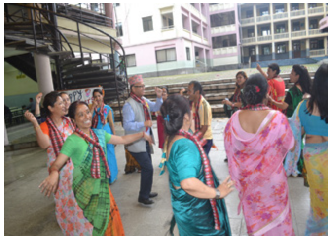
Teachers letting thier hair lose on Teachers Day celebration

In order to achieve an all-round development and education of students, the collaborative responsibility of the parents/guardians, teachers, and the administrative unit of the school cannot be overlooked. In a school, therefore, occasions and events are so scheduled as to provide the parents and guardians with opportunities to interact with the teachers as well as with the school administration personally. Keeping this in mind, during the month of July, the school organized a series of Class-wise Family Days (for classes 3, 4, and 5) and a Parents' Night for Classes 9 & 10.