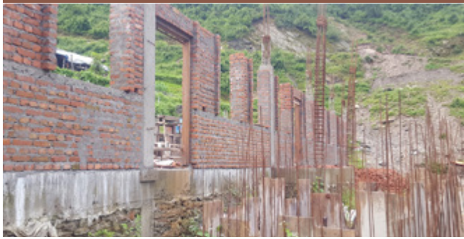
Community Prayer Hall construction in progress at Namsa