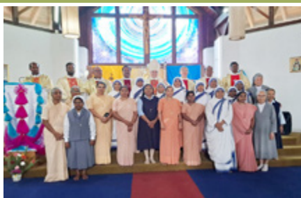
Pokhara CRN with the Nuncio