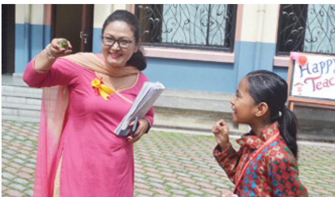
A Student getting excited at the sight of a baby bird