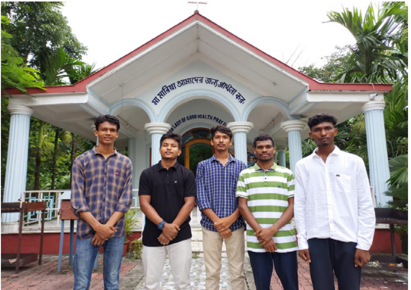
New pre-novices for Nepal at Matigara