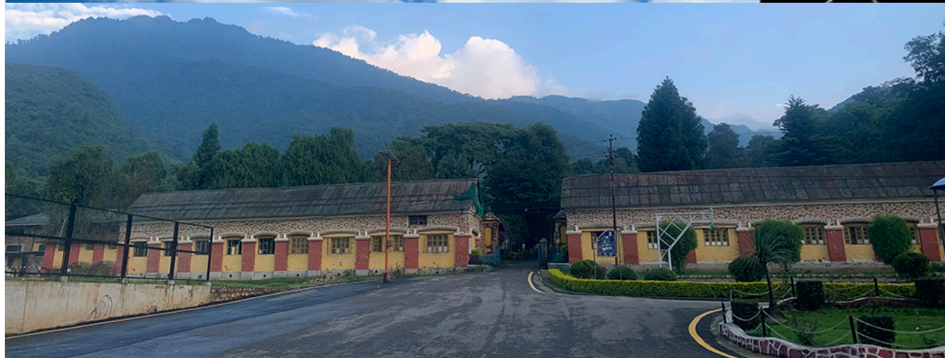
Entrance view of the school