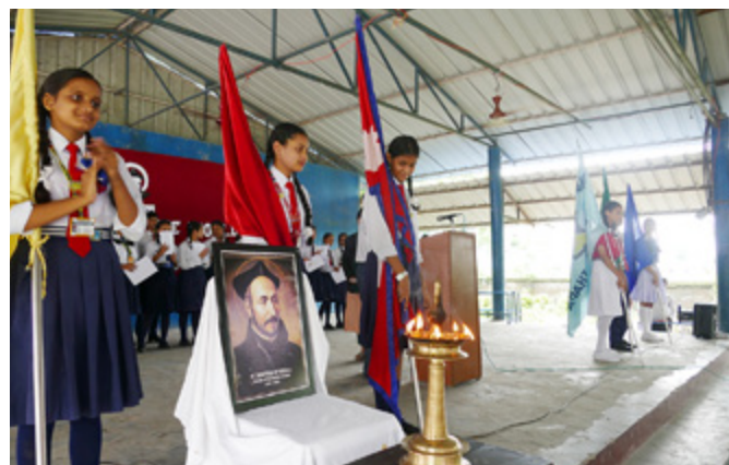
Closing ceremony of Ignatian Year in the school