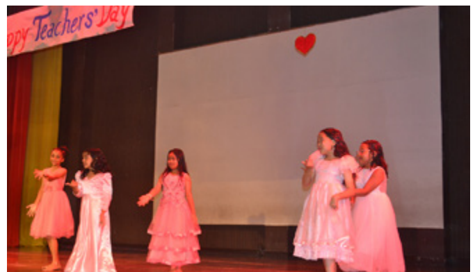
Children celebrate Teachers' day with a dance