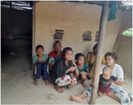
A family of deceased father