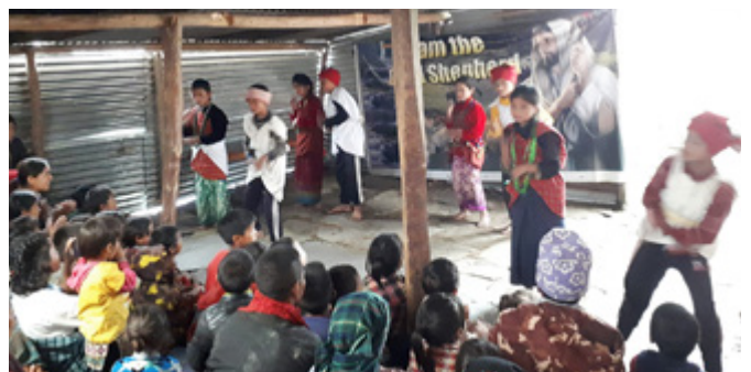
Ignatius Feast Day celebration at Good Shepherd