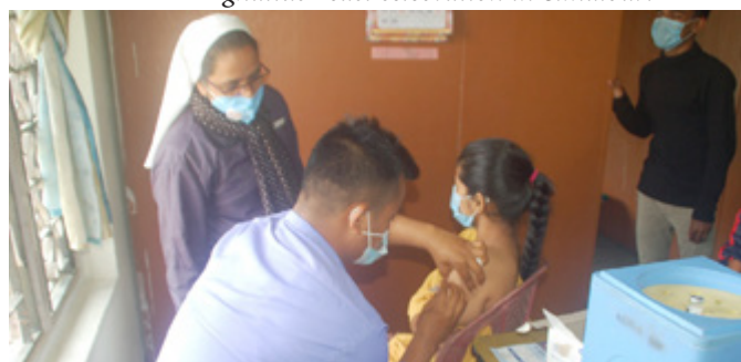
Booster dose administered for children