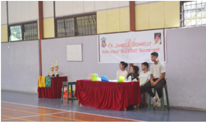
Joint Schools basketball tournament