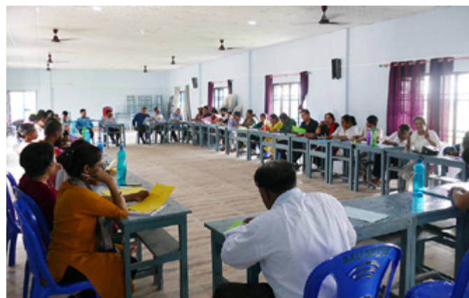
Teachers engrossed in evaluation