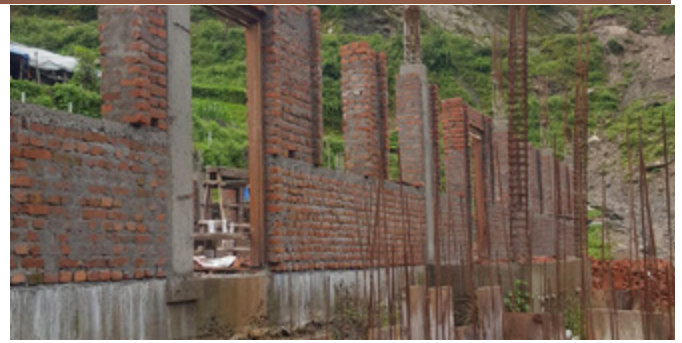
Chapel construction in progress at Lapdung

Terence made progress with the wall construction but a portion of the wall collapsed due to heavy rain; the workers were able to rebuild it. Seven workers from Nepalganj worked with the church building wall but they could not proceed due to a lack of sand and gravel. Due to heavy rains, the trucks cannot reach Tipling; the contractors have to rely on tractors from Pansang Pass. Grace Ghale is appointed as the acting catechist for Good Shepherd Parish Tipling. Anup blessed houses at Namsa and Manu took up house blessings at Lapdung. On the 9th Parish council and youth participated at the