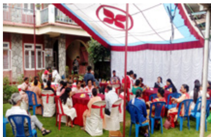
Festive meal at Anna Bhavan - SJC