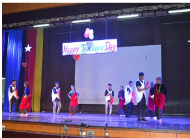
Students perform a cultural show in honour of thier teachers on Teachers Day celebration