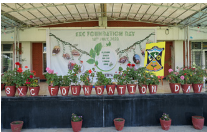
Foundation Day Celebration