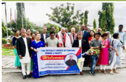
His Excellency received at the airport