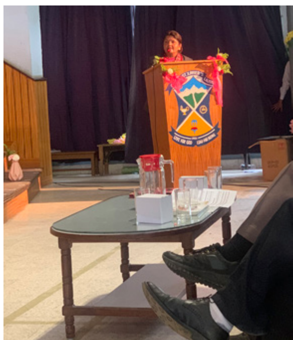
A Guest speaks on Foundation Day