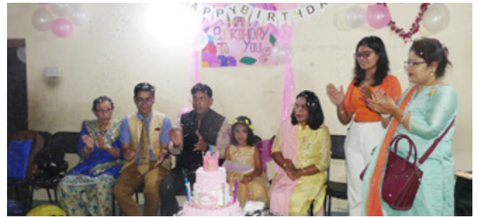
A Jha family celebrates birthday of youngest daughter at A.B.