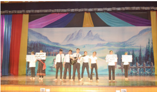
Parents' night, Classes 9 & 10

In the Jesuit Community, we had a team of reconnoi-