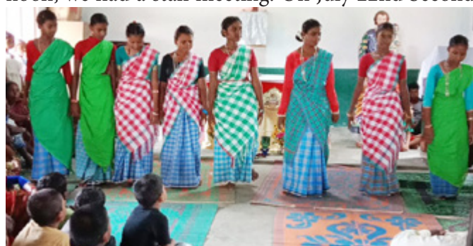
Ignatius Feast celebration in Simalbari