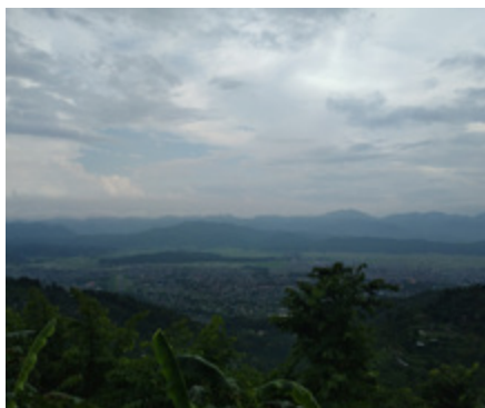
View of Surkhet from Khoria height