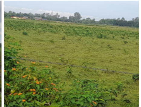
Newly purchased land