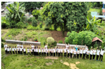
SBK Outdoor bleachers