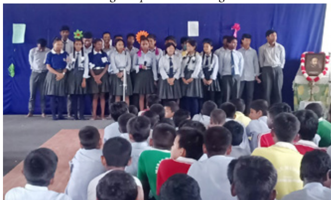
Celebrating Ignatius Day in School