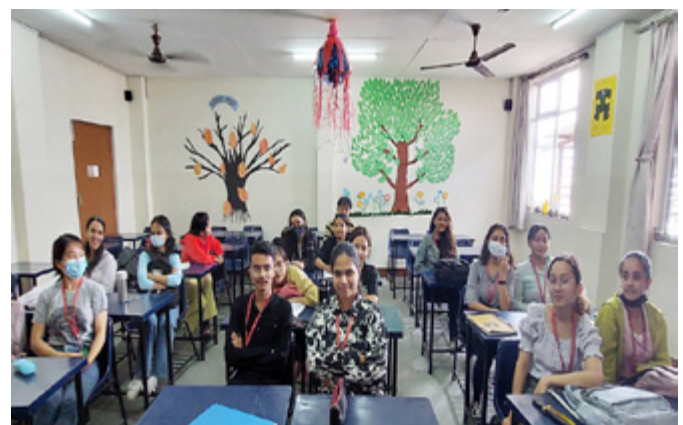
Green Class room