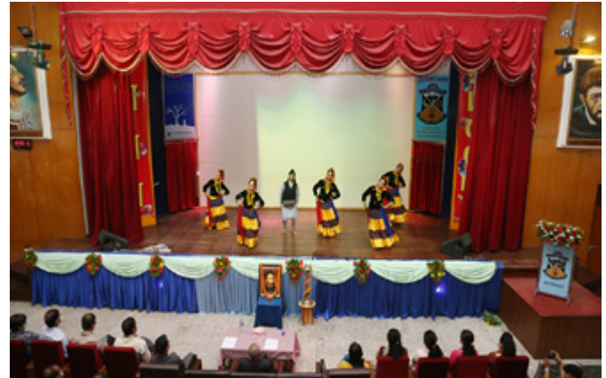
St. Ignatius Day Celebration