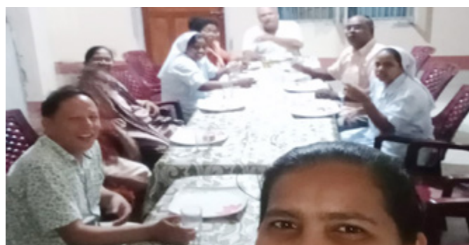
Fathers & Sisters cherish the festive meal