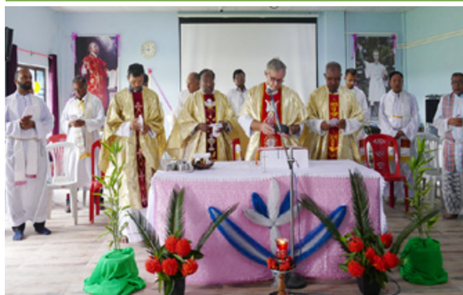
Ignatian Year closing ceremony mass with Religious & Clergy of Eastern Nepal