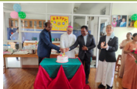
Feast Day cake with Nuncio