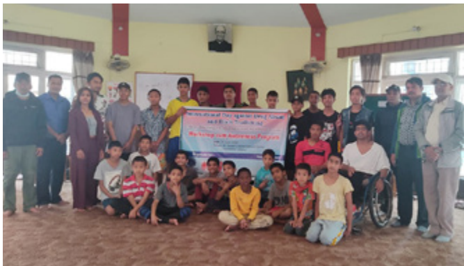
Social Service Centre boys with Salvation Nepal team