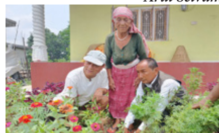
Owners of our rented house