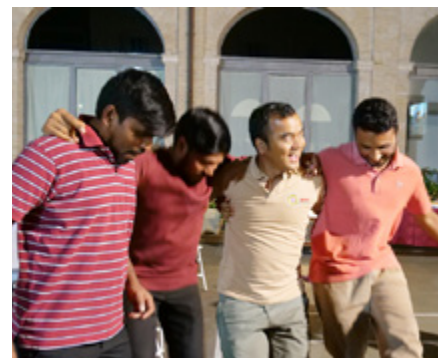
Scholastics 'let their hair loose' after holy hour