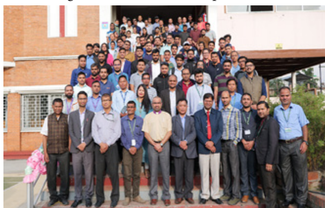
The college staff pose for a photo shoot