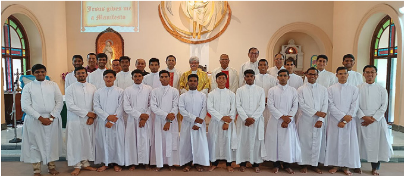
New Juniors from different Provinces of South-Asia at Vinalay Juniorate, Mumbai