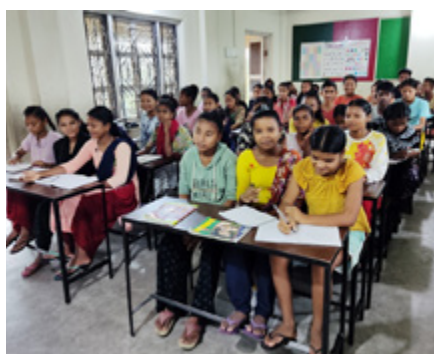
English tuition class for neighbourhood schools students