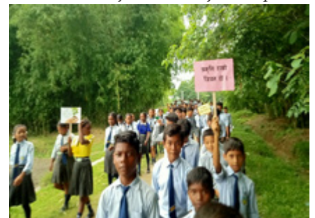
School celebrates Environment Day by planting saplings, taking procession