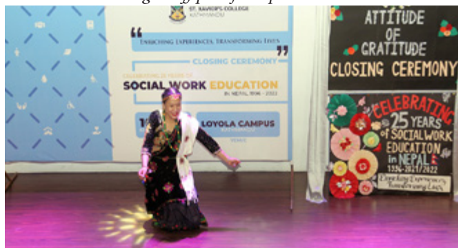
BSW celebrates closing ceremony of Silver Jubilee