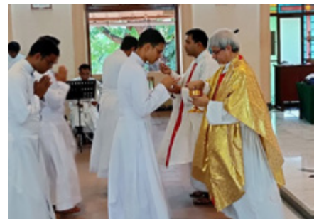
Inaugural Mass of the Holy Spirit before the academic session 2022-23