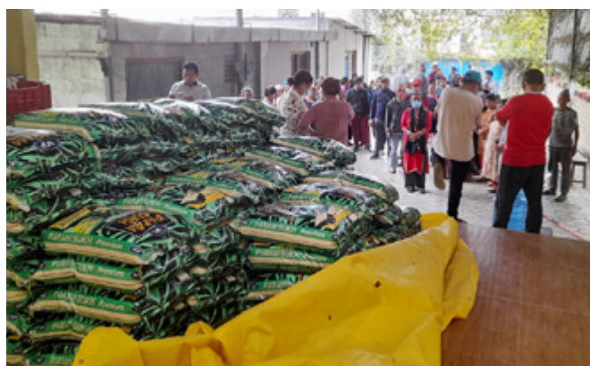
Sacks of rice & dal for distribution around the area