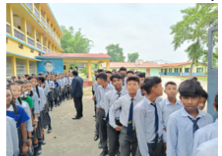
Assembly observed by Principal