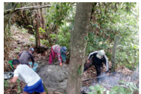
Coworkers putting up fence behind church