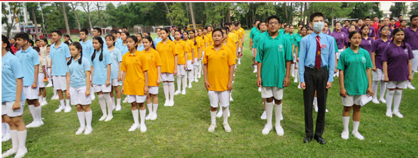
Preparation for Inter-House basketball competition

Day for the parents of our Class 10 students. On that day, the parents had first an input session for about 45 minutes on parenting the 23rd century children followed by the Parents -Teachers' interactions. The Family Day ended with a sumptuous lunch for our parents provided by the school.