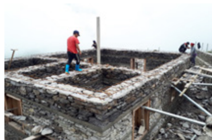
Progress in Lapdung Chapel construction

The month of June brought a large crowd from Kathmandu to Tipling to cast their votes in local body polls. The election crowd was larger than what we usually had during Dasain celebrations.