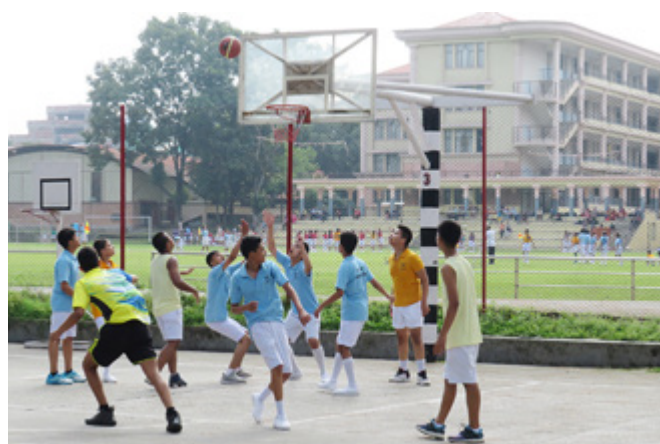
Inter-House basketball competition among the senior boys