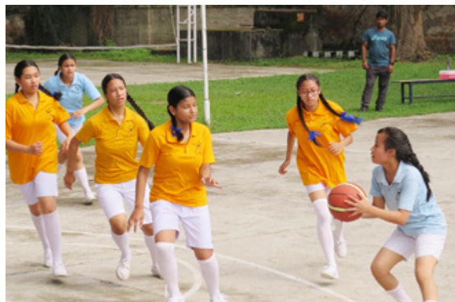
Senior girls competing in the Basketball match