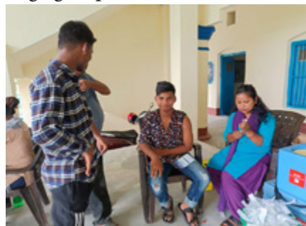
Second dose of Vaccination