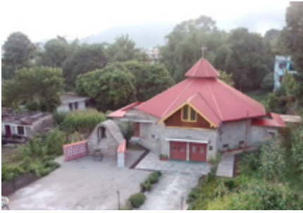
A bird's eyeview of the Church