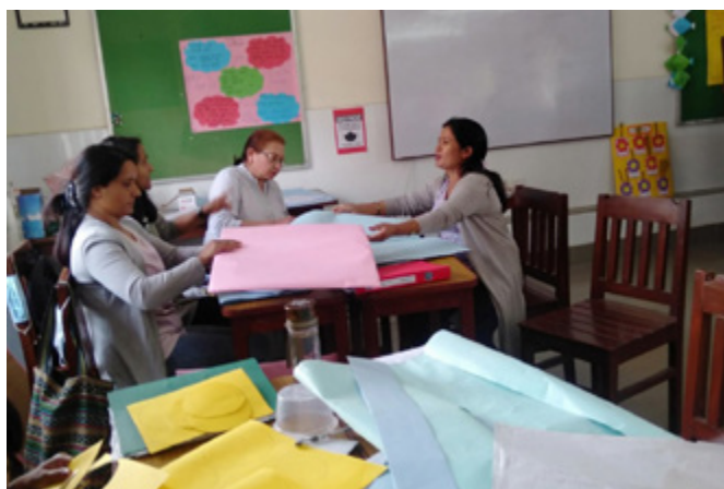
Environment Day preparation