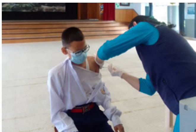
Students receive vaccination