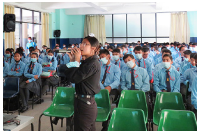
Nepali poem recitation