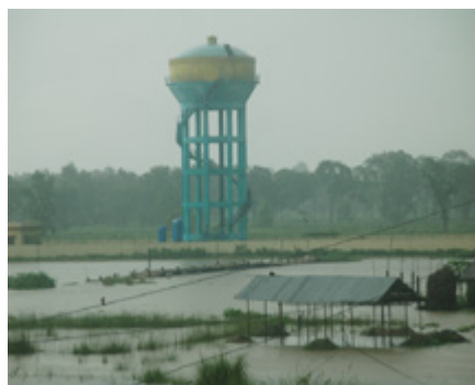
Flooded situation around the school