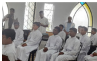
Novices during vow mass