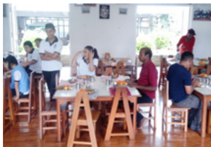
Students in their canteen