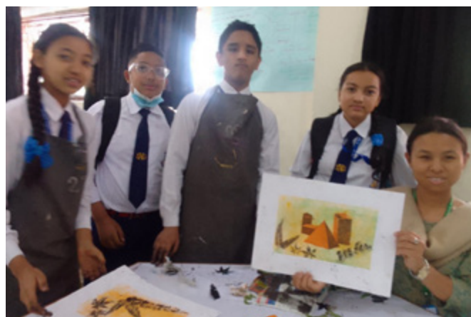
Joint school art competition