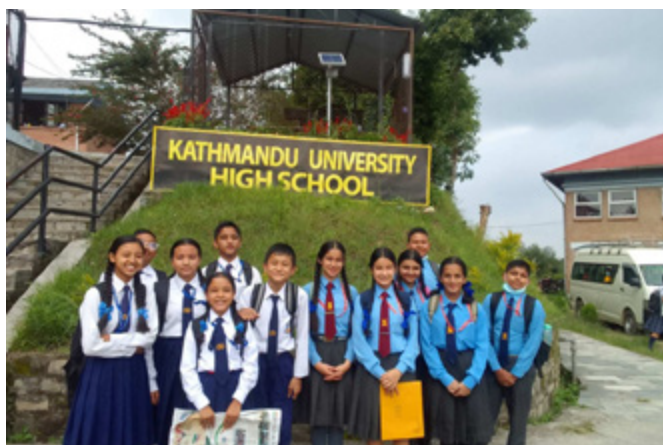
SXG students visiting Kathmandu University High School