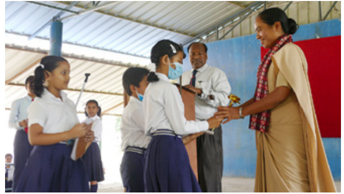
An outgoing Sister is given farewell