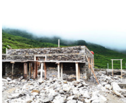
Lapdung Chapel construction