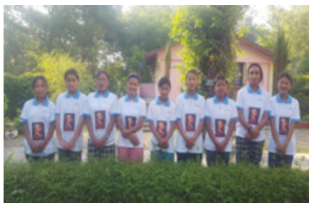
Youths from Good Shepherd Parish, Tipling at Godavari Ashram