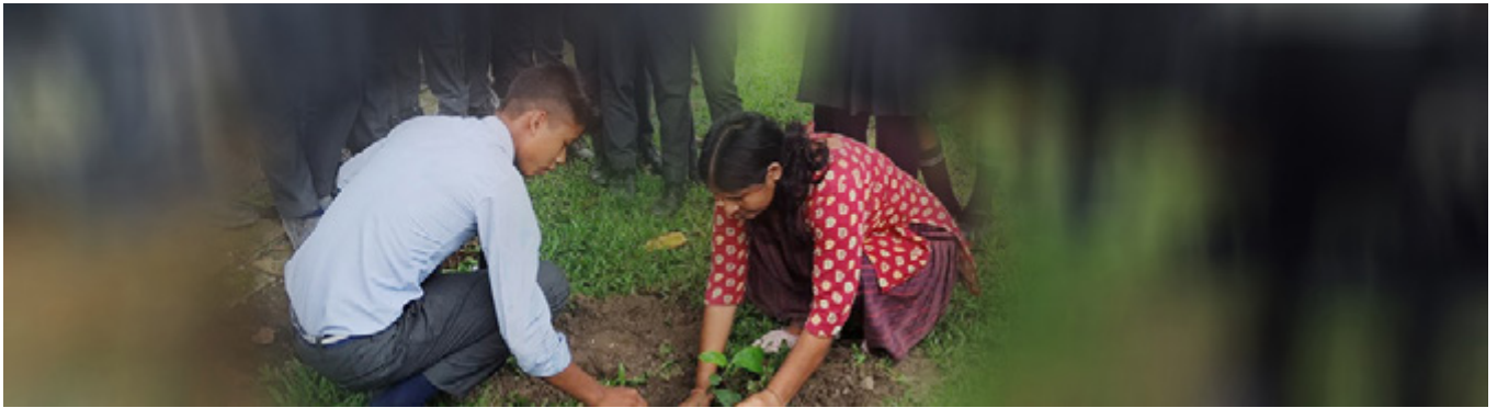
A teacher & a student celebrate Environment Day by planting a sapling

The school celebrated the environmental day on the 8th of June. On that day in the assembly, the principal reiterated the importance of saving mother Earth to enhance our lives and provide a promising future for the coming generation. Soon after the assembly the students and teachers with the placards and slogans took a procession up to Manthri chowk to create awareness among the public on some topics such as: caring for the Mother Earth, reducing pollution, planting more trees, being judicious in using natural resources, defend the cause of sustainable development. The parents were also happy to see their children involved in such life-enhancing activities. In the afternoon each class with their class teacher planted a tree to mark the occasion and furthermore 100 tree saplings were planted on the campus. on June 9, our students between the age group of 12 to 16 years were given a booster dose. On the 26th our junior children between the age group of 4