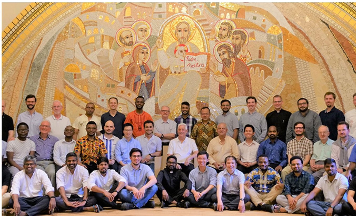
Gesu Scholastics with the Fr. General Arturo Sosa, S.J.

The month of June was very intensive in preparing for the exams and the final paper. The exams started on the first of June. We, the third-year theologians, were given the farewell in the community and at the same time we had them as Gruppo Misti, and in different Assistancy levels. The exams were conducted in two ways; oral and written. We the third years had many written exams than the oral exam. Some of the European Scholastics have returned to their Provinces for various purposes. So far seven newcomers have arrived in our community. On the 21st Fr. General visited the community and celebrated the Holy Eucharist for the whole community. It was a joyful moment for each one of us. At the end of the celebration, all of us gathered in the big chapel and had a group picture with the General. At the end of the exam, the whole community finished the academic year with a grand meal on 24 June. There was the alter blessing ceremony at the Gesu Church on the 14th and I was happy to be part of it as one of the deacons.