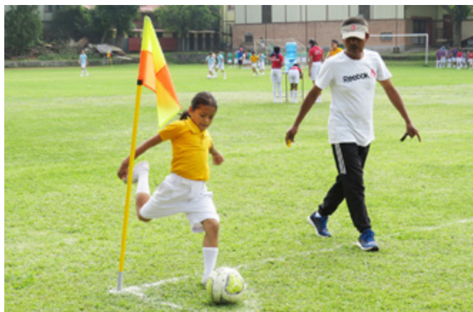
A Junior girl vying for ball to goal post