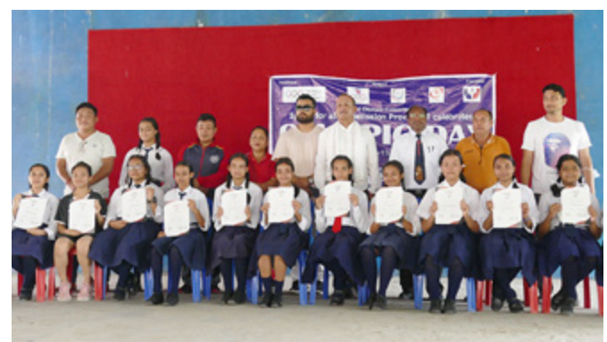
Awardees with their Mini-Olympic winner certificates