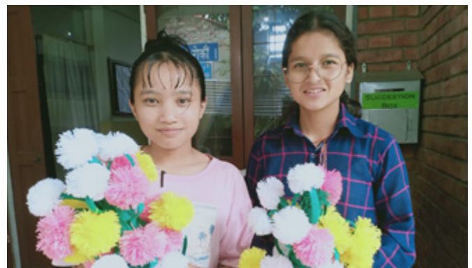
Two girls with fruits of their labours