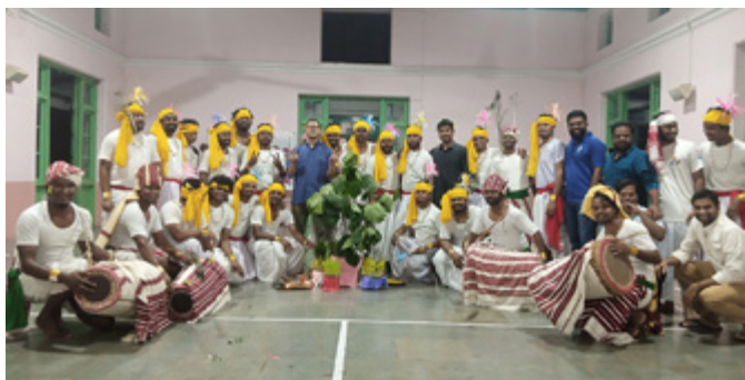
DNC philosophers celebrate Karam feast

The month of October was a very beautiful and pleasant month. Many people came to visit us;