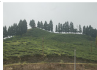
Some tourist interest spots at Kanyam, Ilam District