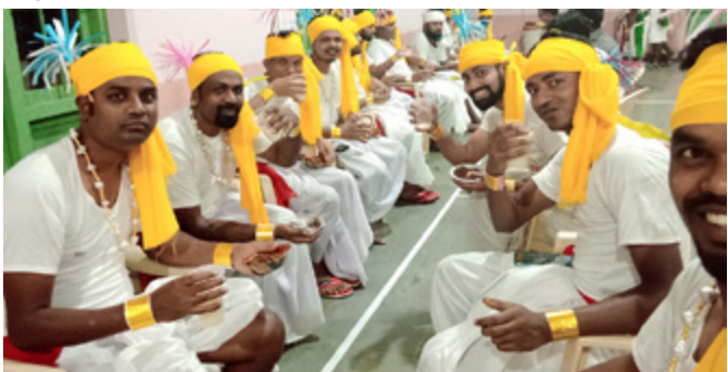
DNC philosophers rest after performance of karam dance