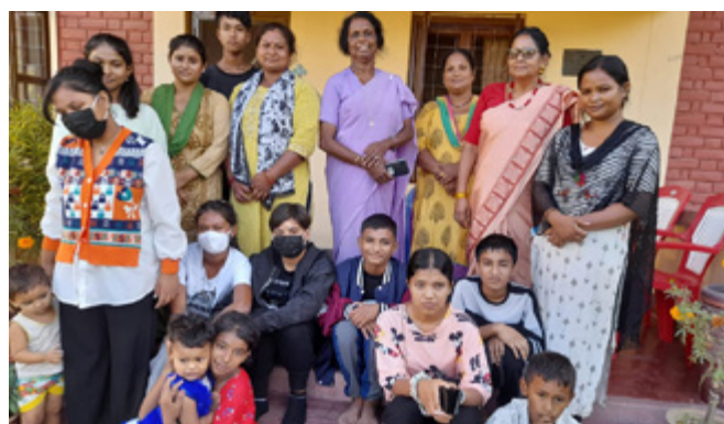
Parishioners of Surkhet town