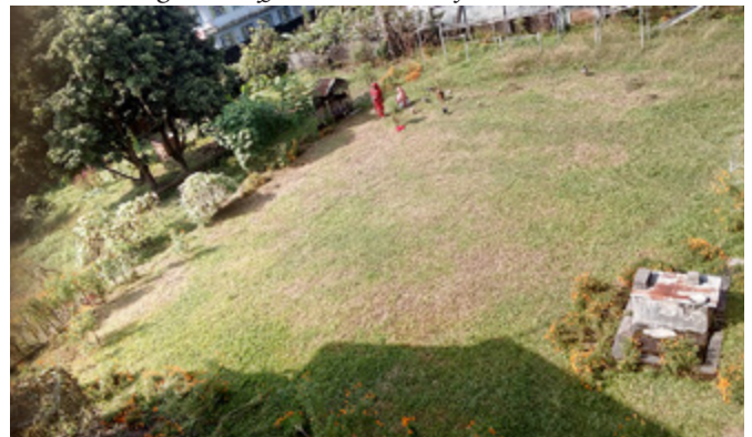
SBK playground waiting for the children