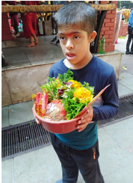
A Student of SBK at a Temple for Dasain puja