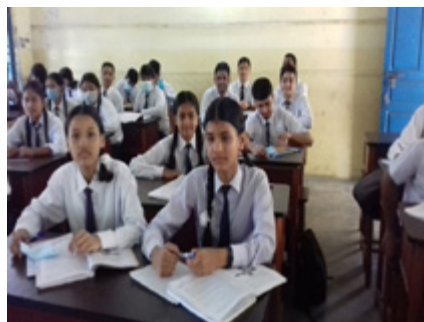
Senior students attending class on-site