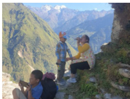
Cl. 5 Student of SXJ going to Tipling