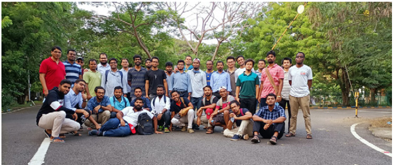
Philosophers of Satya Nilayam, Chennai

The month of October had been a strenuous with lots of dedications and commitments. All the second year philosophers were busy with choosing their dissertation topics while being fully occupied with assignments, presentations, group discussions, above all getting ready for CIA-2 and the semester-3. On October 2 along with a few scholastics, I took the vaccination-2 successfully. On the 9th, a long awaited day at last arrived, educational tour to Pondicherry. It was a day of fun, enjoyment, above all a great learning. From October 18-22 we all were busy with second Continuous Internal Assessment (CIA) tests and on the last day of the test we visited the Birla Planetarium. All enjoyed and learnt history and growth of India and the development of Science especially from the space theatre.