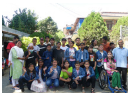
Children with after Dasain Tika