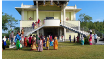
Parishioners attending retreat