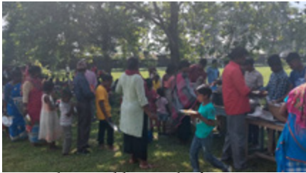
Lunch served by youths for retreatants