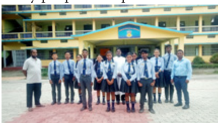
Senior students with thier Principal