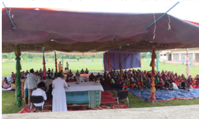
Retreat preached by a Salesian priest