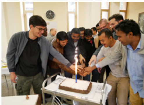
Common birthday celebration