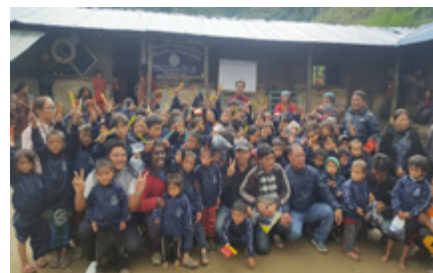
Students, staff of Gothandevi school