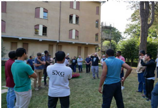
Theologians having community building exercises