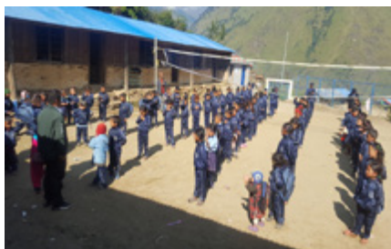
Children with tracksuits