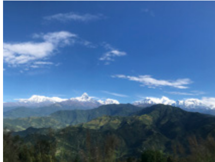
Mt. Fishtail range seen from Pokhara

Traffic jam at a highway their school fee studying in LKG to Class 10 among whom majority of them study at Jalupa School, Baniyatar. At St. Xavier's School, Jawalakhel all the students from Baniyatar Church are on a minimum tuition fee payment as they are heavily subsidized by the given maximum scholarships in the school. St. Ignatius Church, Baniyatar continues with her daily online live Mass at 7 a.m. Anyone can attend it. For the last few months, the parish priest has started giving a physical holy Mass to the Bambino Sisters every Wednesday at Prernalaya Convent. This too is a streamed as a Zoom online Mass for the others. The parish priest has been regularly encouraging the parishioners to attend at least one Mass physically on weekdays in the church to avoid the big crowds on Saturdays. The entire church has been divided into six zones and one zone gets its turn every Saturday to attend the holy Mass physically and for the others same Mass is live streamed online. The parish priest is on wait and watch mode for the new COVID-19 situation after Dashain and Tihar (Dussehra & Deepawali) holidays to open the Church fully on Saturdays. The parishioners are