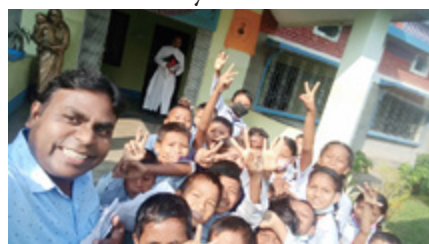
Junior students, selfy with thier Principal