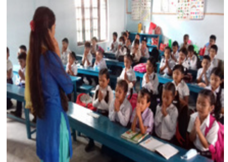
Teachers and young students engrossed in morning meditation

ally'. The major step after weeks of online classes has been to resume real, face-to-face physical classes for all students, from primary to plus two. The next step was then to divide each class into two groups and alternate class days for each group. Then, the senior classes resumed full attendance each day. Now, the school looks forward to full attendance for all students after the coming Tihar holidays. Students are required to wear masks however so 'fully normal' is still a devout hope.