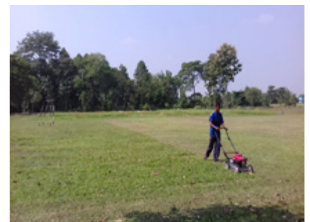
A new lawn mower has arrived

Bony is our default driver and reception person at our local airport or at the Indian border. In case you plan to cross note that (some) border officials check I.D. fairly strictly, including vaccination cer-