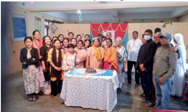
Sr. celebrates her birthday with her friends