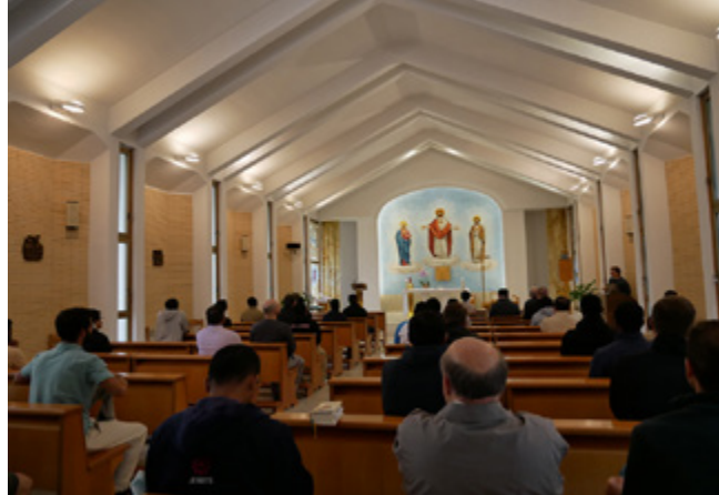
Community building mass