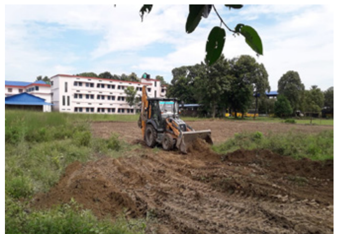
School compound is extended