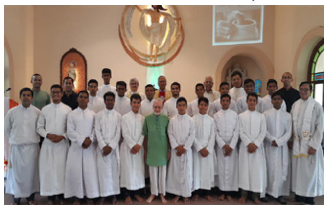
New Juniors & novices with their formators