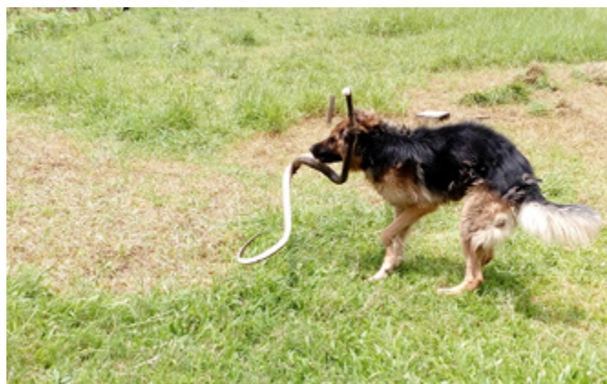
Lucky attacks uninvited intruder