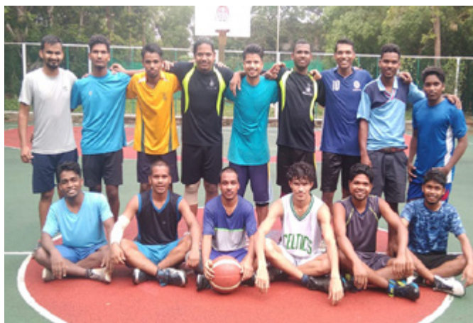
Premal Jyoti scholastics ready for Ignatian football tournament