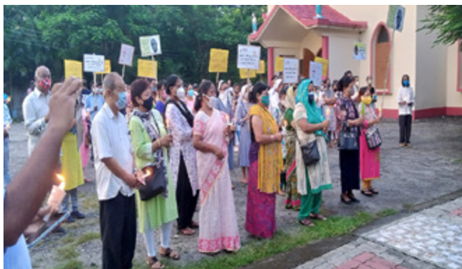
Parishioners participating in the rally