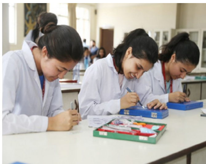
Students in their respective labs