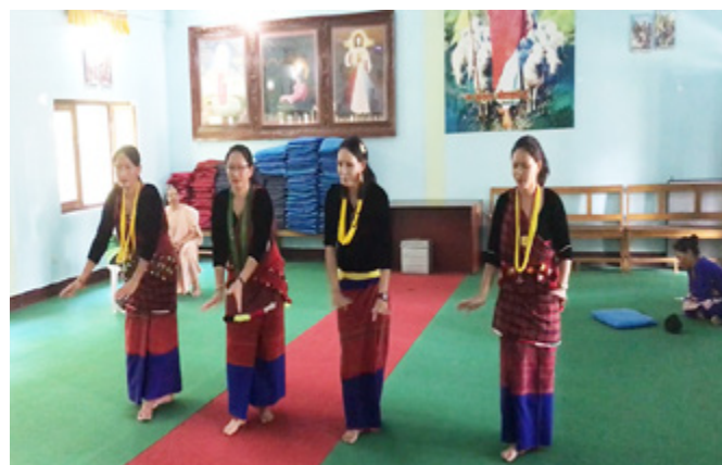
Those parishioners who attended onsite mass participating in cultural dances