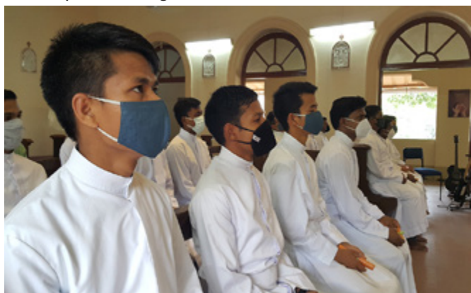
New Juniors in Vinalaya

The first step towards getting somewhere is to decide that you are not going to stay where you are”, says J.P. Morgan.