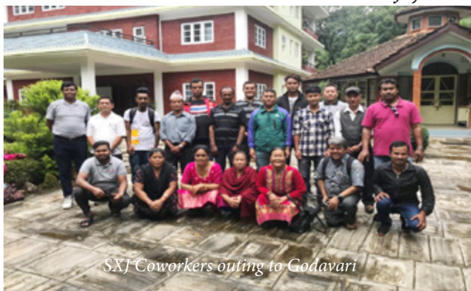
SXJ Coworkers outing to Godavari