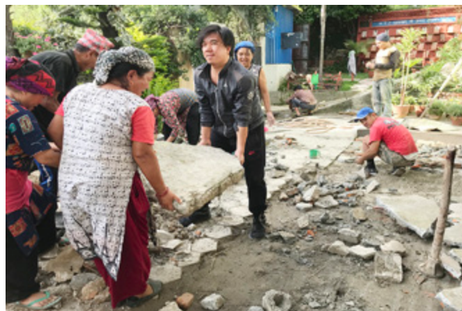
Parishioners expanding the front lawn

As lockdown was partially lifted, the parish priest