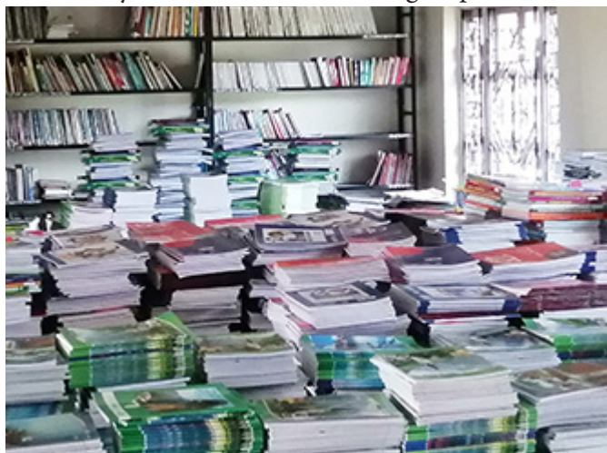
Books ordered for new academic session