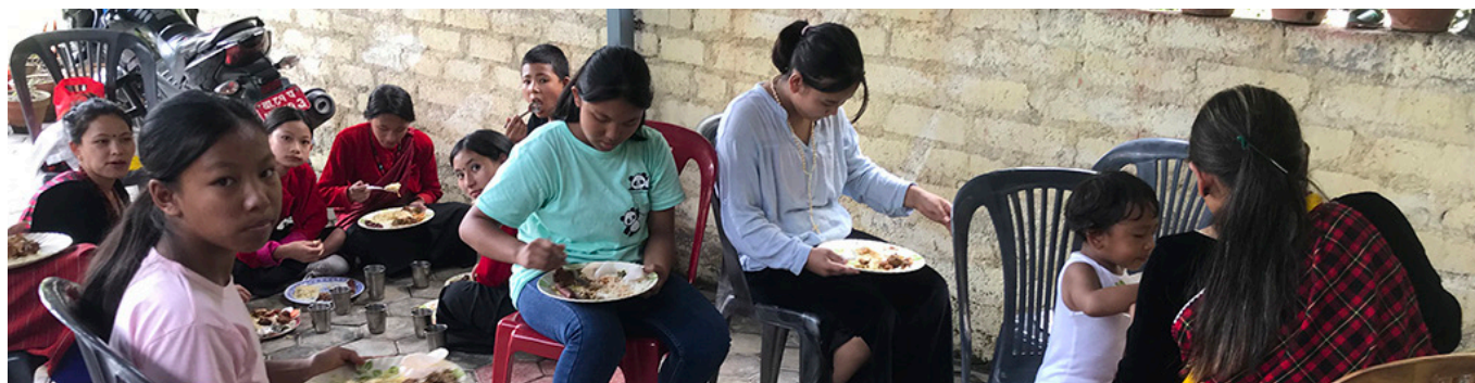
Some parishioners enjoying feast day agape in the church premises