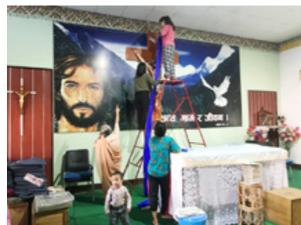
Decoration is in progress

of lockdown. They contributed their physical labour to remove church hall staircase, to repair the other, and then finally clean up entire church premises for the feast. Now, front part of the Church has a wide