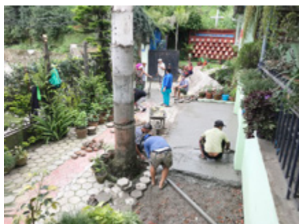
Congretizing the new front lawn