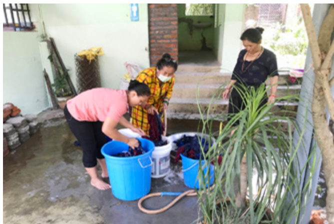
Cleaning of church premises by women

In July, many schools in the Kathmandu valley started opening online. Therefore, Sunday Holy Mass was brought back to Saturdays. St Ignatius Catholic