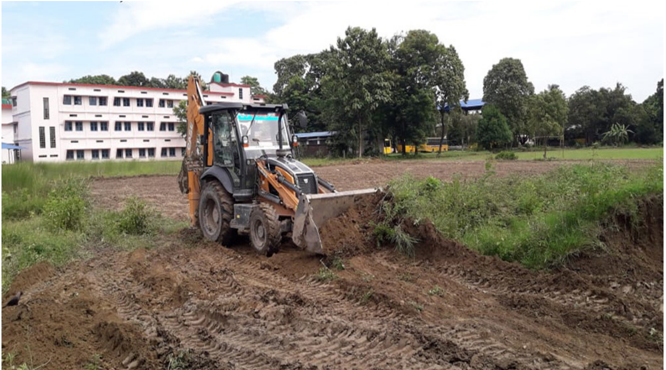
School compound is extended

An advantage of living on the Nepal-India border is the coming-and-going of interesting guests. The campus has been getting a 'make-over' while the students are away.