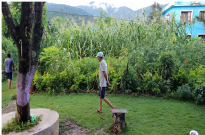
Garden in front of new rented house