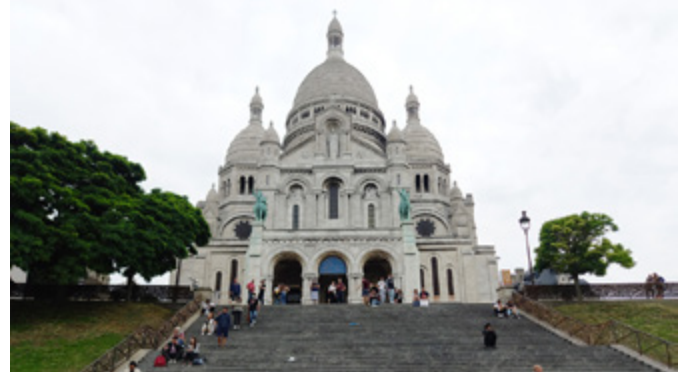
Sacred Heart Church, Paris