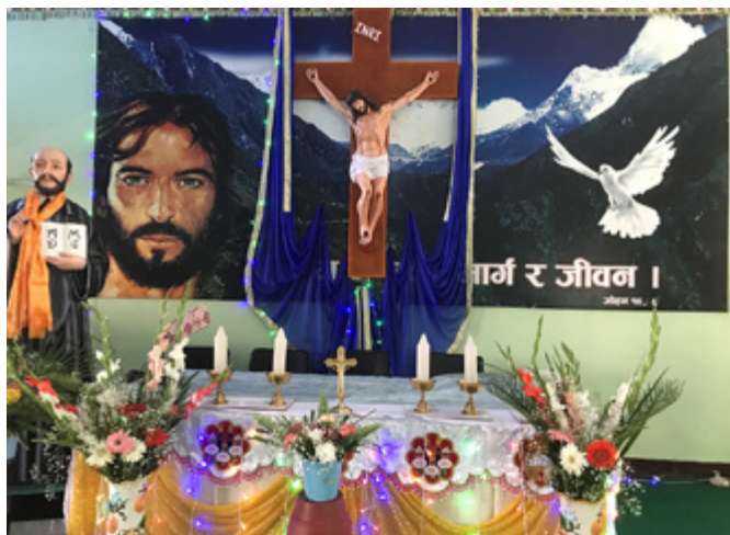
All set for online Holy Mass on Zoom

choir and now for St. Ignatius Feast Day Novena.