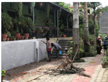
Painting work on veranda wall