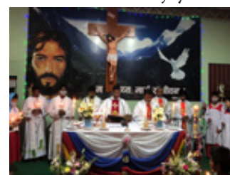
Jesuits of SXJ participating in Easter Vigil mass