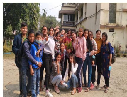
School Eco-club participants