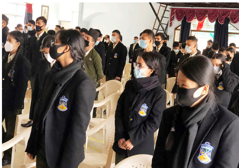
Class 11 & 12 resume attending physical classes