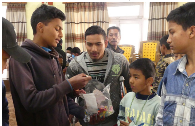
Talent show by children

Month of January went smoothly till the end. We had an awareness program at St. Xavier's