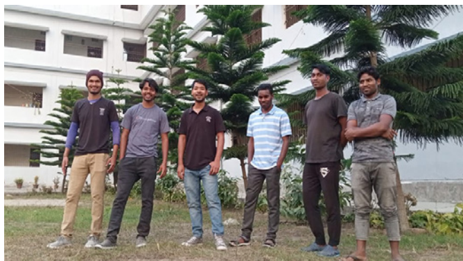
Schoastics at St. Xavier's Rajgang