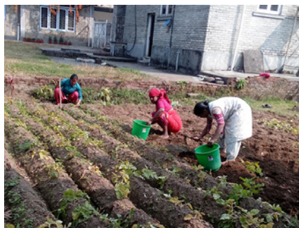
Coworkers and a Sister harvest Potatoes