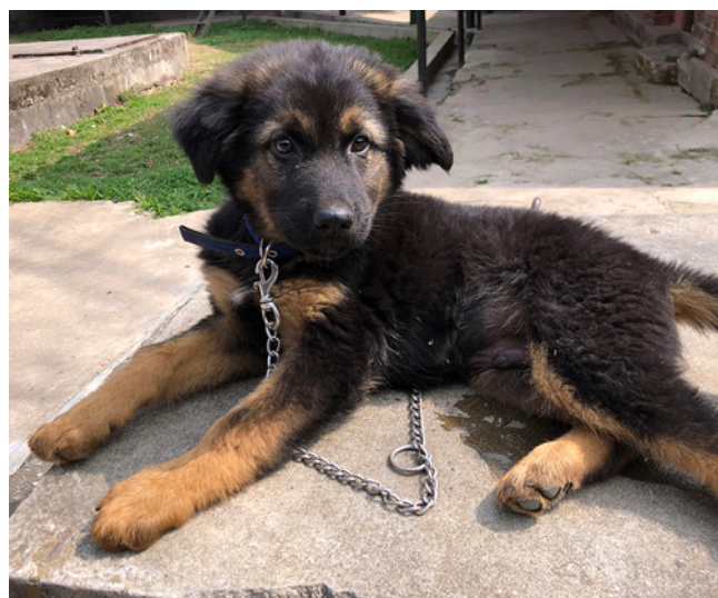
new bhote dog “SHINGHAM”