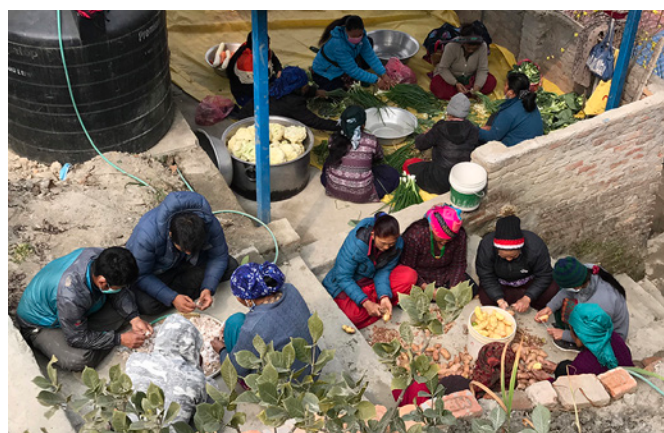
Prem bhoj in honor of Baptism