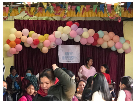
Celebration of a Baptism for a baby girl