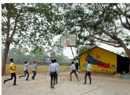
Students get coaching in Basketball game