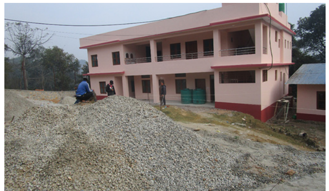
New administrative block, classes, NJSI, Kavre