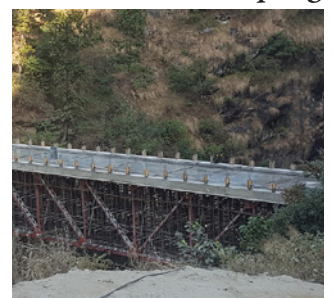
new bridge after Dhundhure