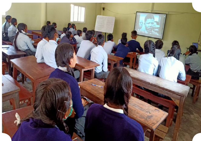
Multimedia teaching-learning exercise

getting ready for the cycle test, which will begin from 28th February onwards.