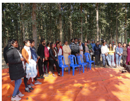
School staff picnic