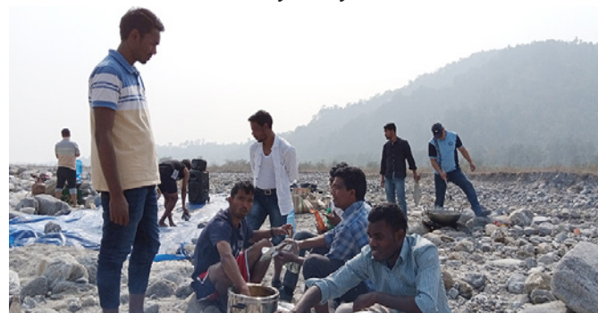
Scholastic picnic to Lohagar