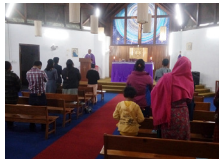
Physical attendance in the church resumes