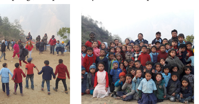
Primary school staff and children picnic

at Dundure connecting Dhading to very close to Tipling.) People here say we will have power twenty-four hours seven days a week very soon. The other good news on the development front is the arrival of 4G, toilets in every home along with a private water connection to spring fed water tanks provided by the municipality.