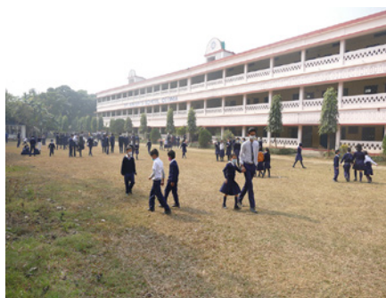
Seniour students guide juniors