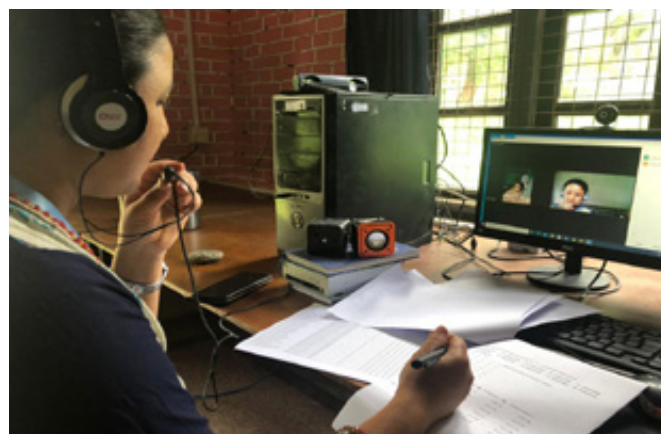
Online class goes on

As the pandemic progresses, the school continues with remote learning. New regulations and guidelines from the Government and the ministry for Education have been issued about admission, but they seemed to be unclear and confusing. In the first week of September online admission test was held for class one. This was the first time in SXG history. The tiny tots were very smart in appearing for the test. In the second week of September class 11 admission test was conducted. In the fourth week, both classes and orientation were conducted for students and parents. Rest of the classes had online assessments. Fr. Samuel and his team worked very hard to organize all the tests and admission. Mr. Indira Gurung presented online seminar to teaching staff about stress management.