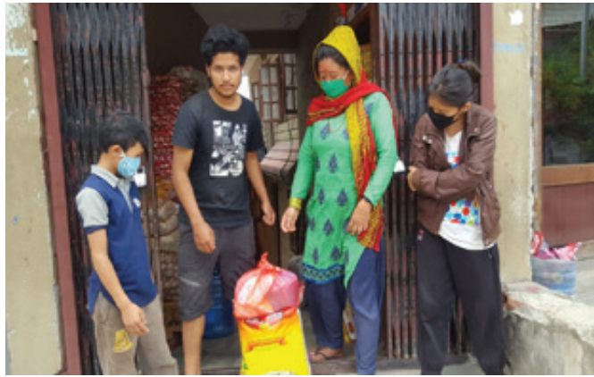
Dry ration supplies to the needy

In the month of August there were regular Masses for the faithful on their request for small groups.