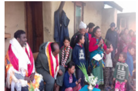
A parishioner giving farewell speech

Earlier in the month Good Shepherd Parish held a simple graduation ceremony for Tipling's class ten graduates.