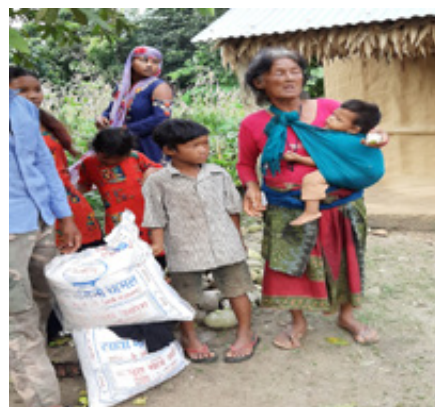
Relief materials: food supplies, medicine distributed to evacuated Chepang community in Chitwan

land in Chitwan and were evicted from their houses. NJS also helped the residents of Kumarigal, Kathmandu with food supplies through Holy Cross Sisters.