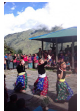
Parish youths expressing gratitude through dances