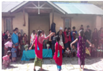
Children enthrall Fathers with their dance