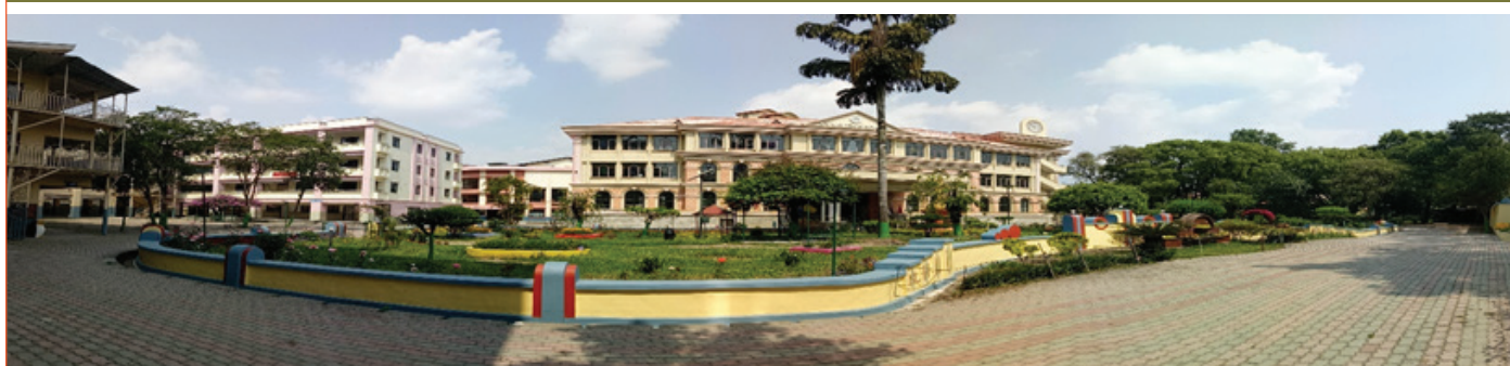
St. Xavier's School, Jawalakhel