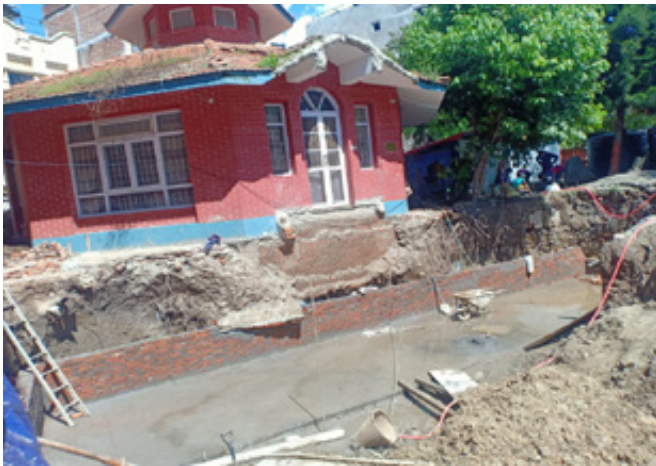
Foundation work started at SXSSC

In the midst of prevailing Covid-19 pandemic and lockdowns we have kept up ourselves lively and energetic. We engage in different physical and mental works: cleaning around house, gardening, reading and coming together as SXSSC family in order to encourage and support each other, and motivate ourselves emotionally and mentally to fight against the pandemic. It has been a good time for all us to develop our skills and build good relations among ourselves by spending time together.