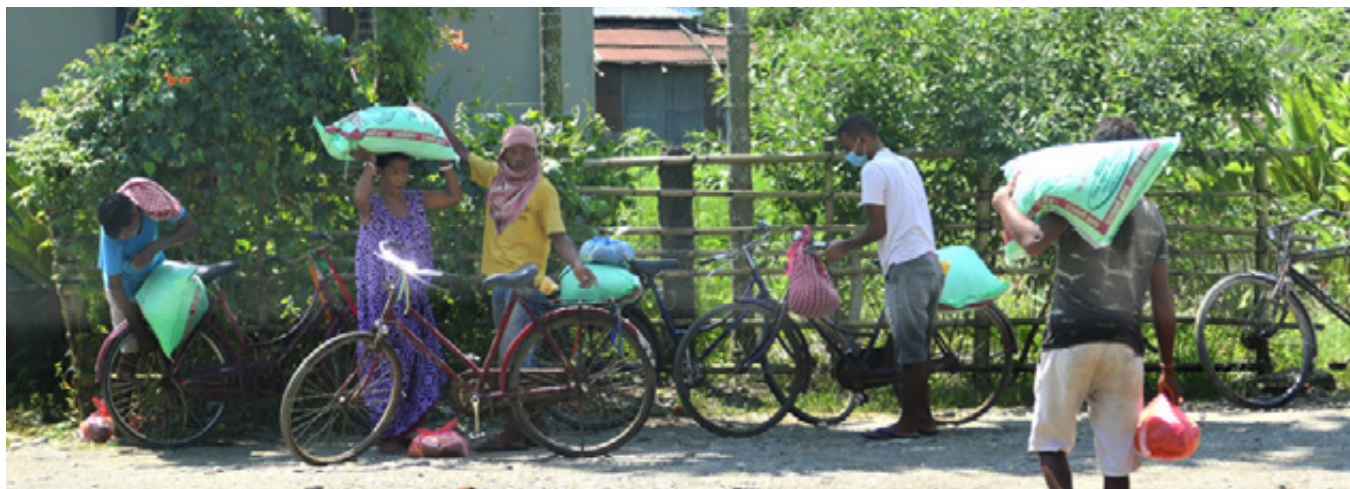
Pandemic dry ration distribution