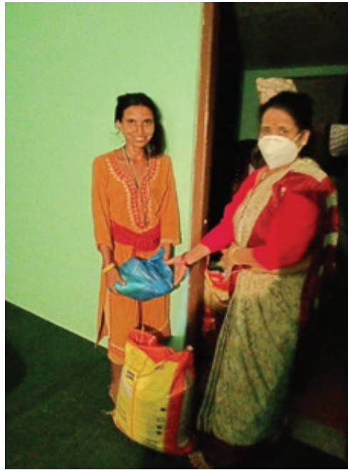
Happy to receive something to eat