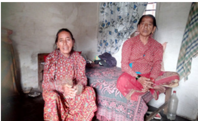
Catholic family of Lamachowar village