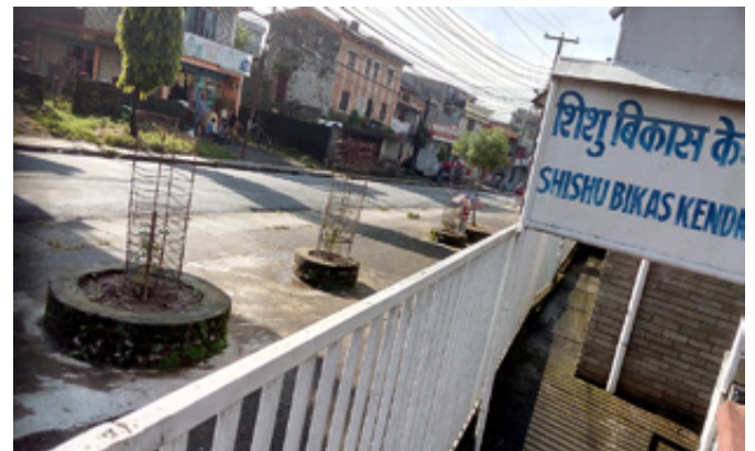
Kapoor trees planted in front of SBK