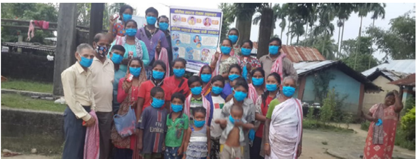
Members of Believers Church receive food supplies