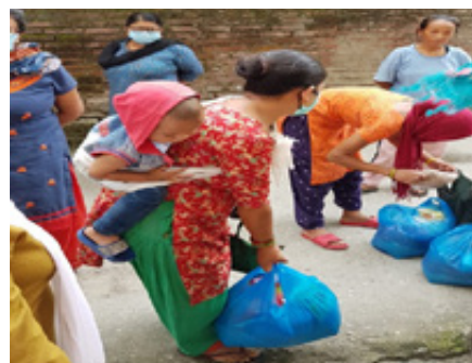
Dry food ration arranged and distributed to residents of Kumarigal, Kathmandu