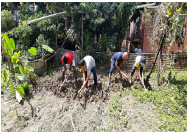
Gafney Bhavan inmates prepare kitchen garden for vegetables