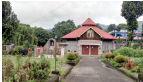
Anna Maria Church, Pokhara