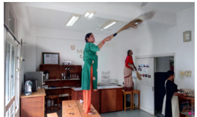
Cleaning ahead of school reopening