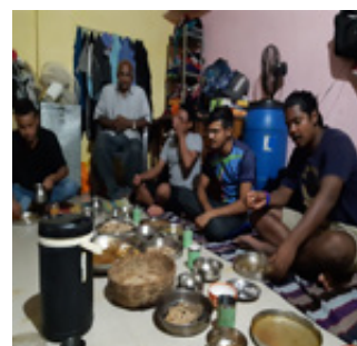
Glimpse of scholastics visit to North Gujarat