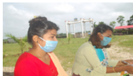
1. Teachers taking body temperature of parents, 2. Washing hands with soap, 3. Teachers taking attendance of parents