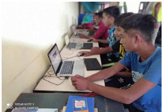
SXSSC boys engaged in online classes