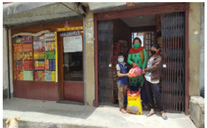
Needy neighbours receive food supplies