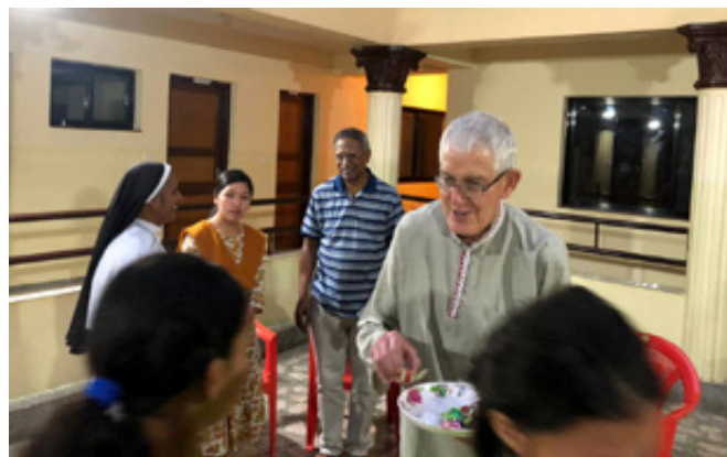
The SEE result of SXG 2076

We had very good Secondary Education Examination (SEE) result.