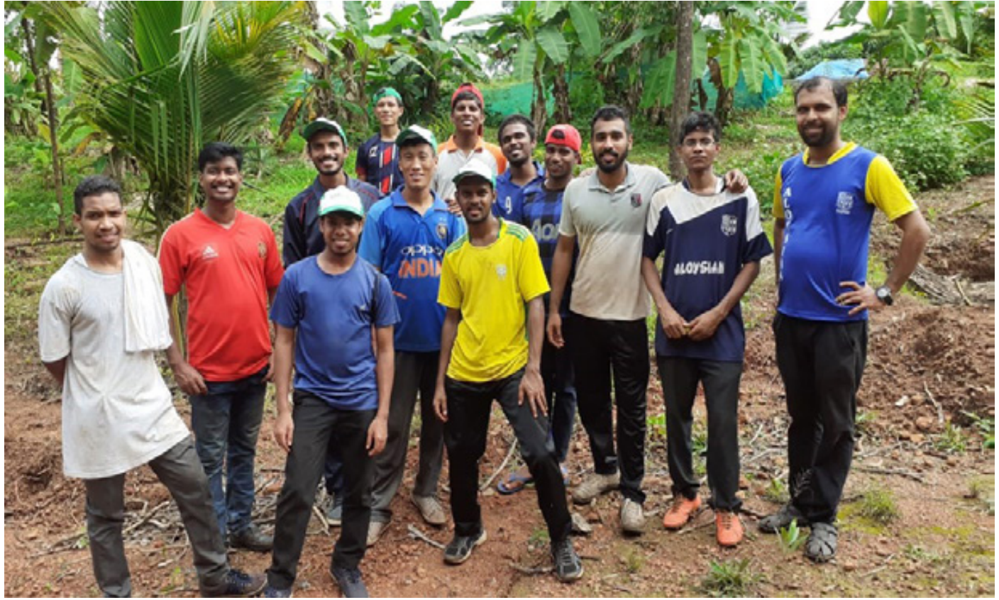
AshaKiran Scholastics working in Anjali firmland.