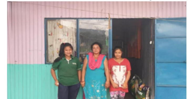
One of SXSSC inmates gets relief material for her family