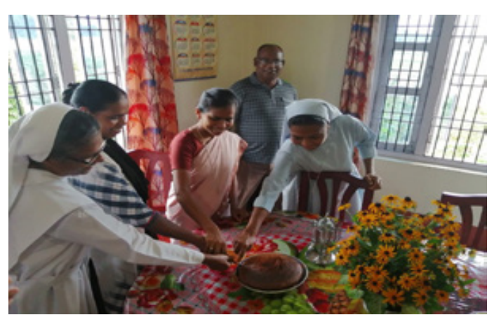
St. Ann's Feast day celebration