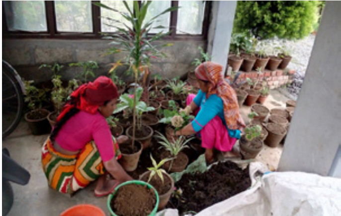
Coworkers busy in thier work