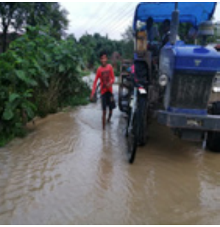
Flood scenerio in neighbourhood