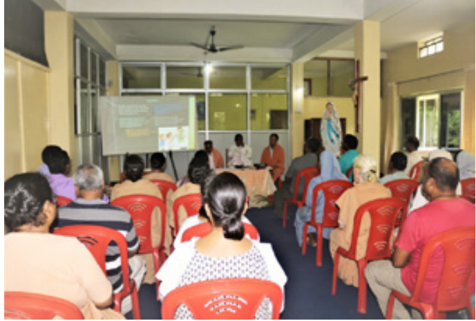
Jhapa Jesuits with religious collaborates celebrate