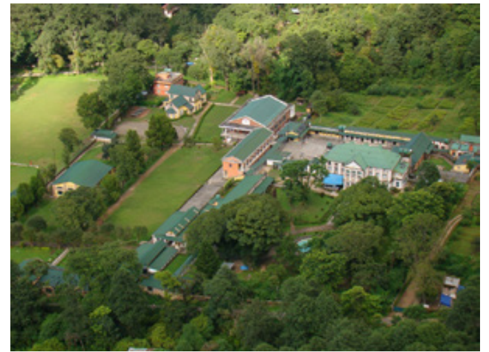
Arial view of the school from marbal quary.

St. Xavier's School, Godavari celebrated