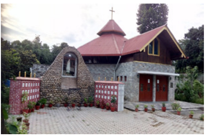
St. Anne's Church, Pokhara

Shishu Bikas Kendra remains closed and silent. The premises miss the tottering and muttering of children. Few students video chat with teachers.