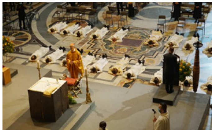
Diaconate and Priestly ordinations

month of preparation of different things. In general, all the theologians were very busy studying for the exams and working on the final papers. The exams were conducted in two ways; oral and written. For some professors we had gone to the University for the exams and for some others we had it online through Zoom and Google Meet. The house had only one main event in this month on 27th of June, that was the Diaconate Ordination of the third-year theologians. Along with Deacons two from Biblicum had the Priestly Ordination as well. Since the