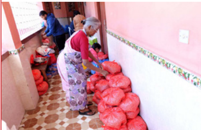
NJSI distributes food materials to villagers

down yet looking at the need has ventured into giving food materials to the families of the Special Children who hail mostly from the daily la-