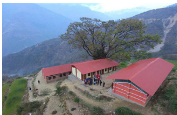
Shree Adarsha Basic School