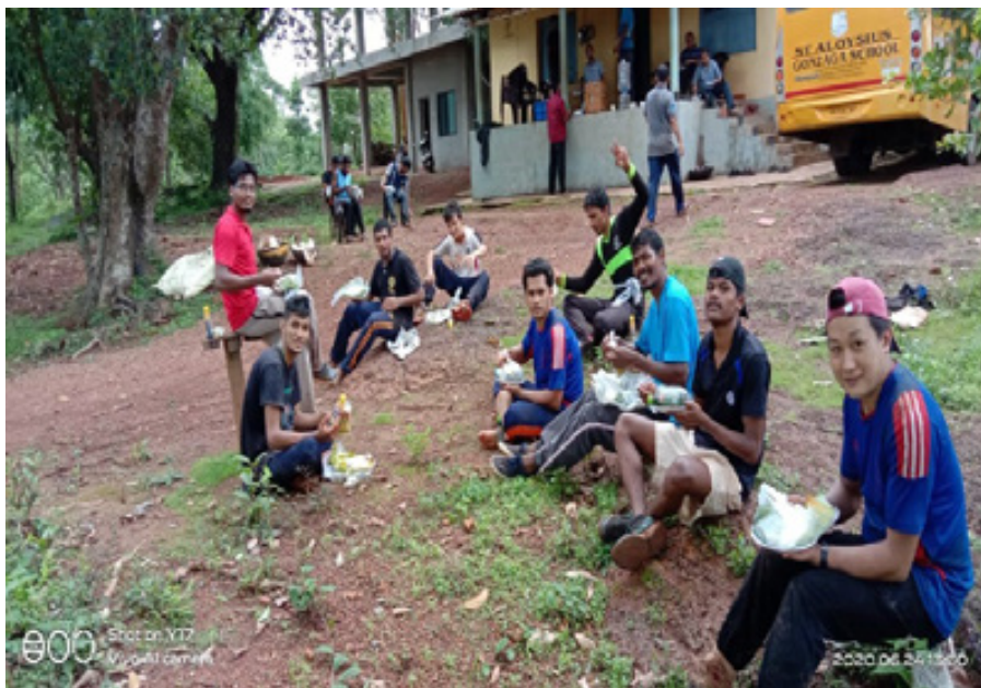
Good meal after hard work in the farm

On 23rd we had community meeting based on community activities, apostolic life and Covid-19. The main questions were: What are we doing during these days? What need to be done? And How to face if someone gets Covid-19. On 24th our second year brothers with some of third