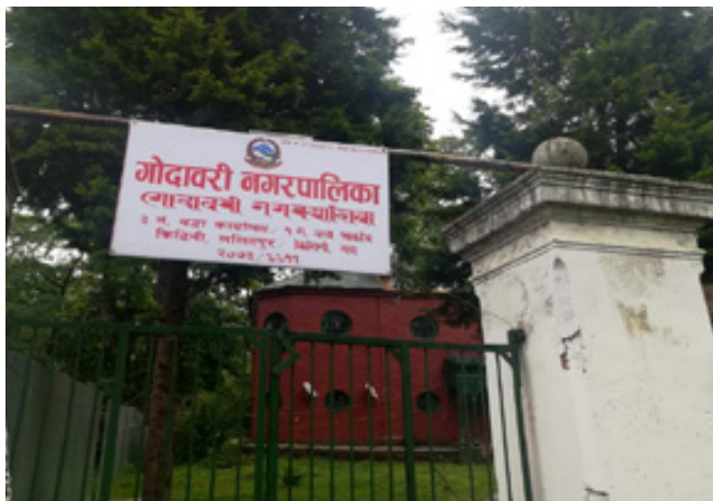
Keshar Mahal, teachers quarter

and the land through rowdy and unruly ways. They wanted to make Keshar Mahal a ward office and quarantine place without any legal documents and procedures. They did not consult the school management. Evil nexus are very strong operating in background.