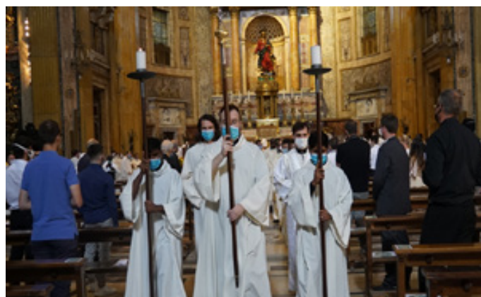
Ordination ceremony in Gesu