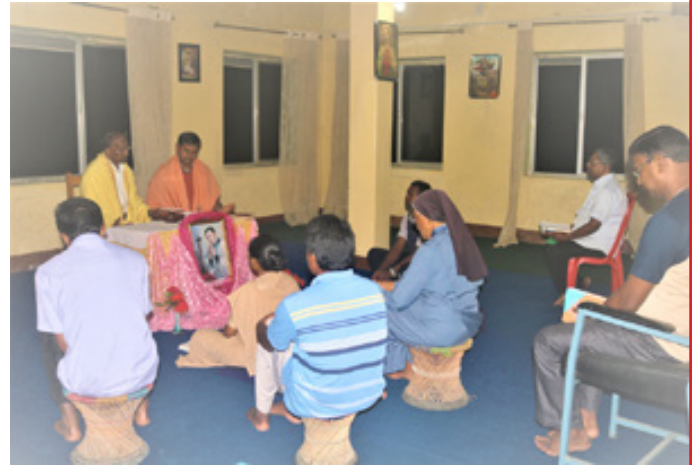
Thanksgiving eucharist in SCD community