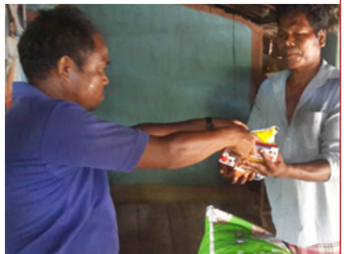
Distribution of food materials around St. Xavier's parish.