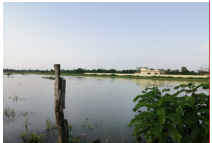
Flooded scene next to St. Xavier's School