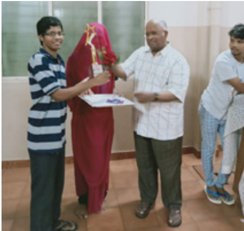
Community Day celebration

At the beginning of this month we had a volleyball match with the Juniors who recently came back from their home visits. Two of them joined our community. We also celebrated two of our brothers' birthday. On 5th of June on the occasion of World Environment Day our ecological community organized a small programme. We had creative community prayer specially praying for the mother earth. Soon after the prayer we planted sapling; then a short programme followed based on global warming.