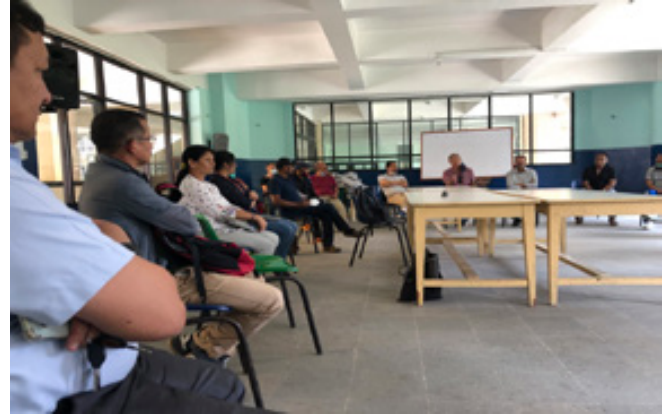
Local parents meet

Many meetings were conducted with local parent and the people of goodwill on the same issues. They showed concerns and came up with various sugges-