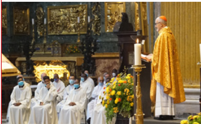
His Eminence Michael F. Czerny SJ

number of the participants were limited, the event was live telecasted in YouTube. The main celebrant was the Jesuit Cardinal, His Eminence Michael F. Czerny SJ, and the General, Fr. Arturo Sosa SJ, was