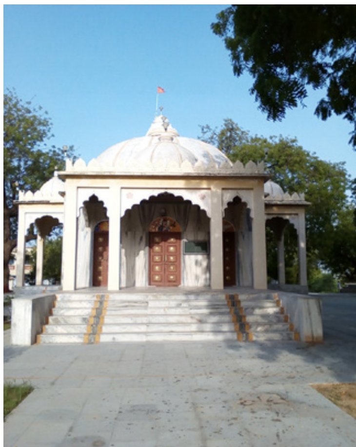
Shrine of Our Lady of Camels