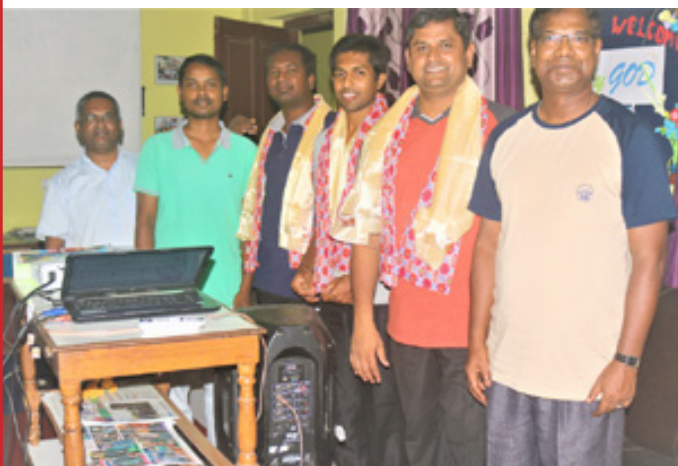
Three outgoing members with remaining members