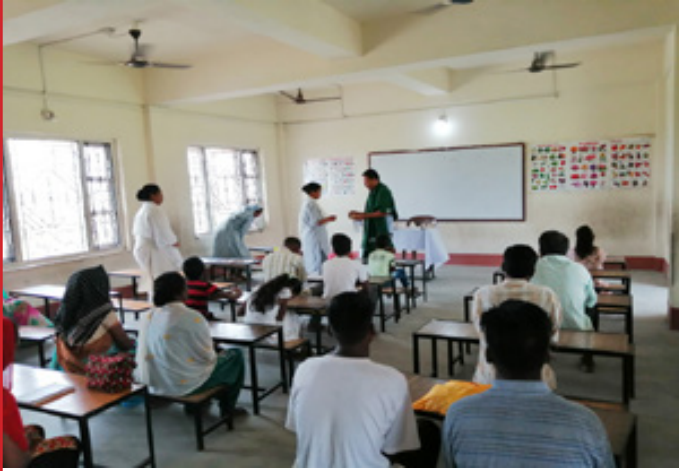
Eucharist in a classroom with social distancing

As lock down continues, things are getting difficult and tougher for the people. In St. Xavier's School, Sadakbari, we continue to reach out to our students, door to door delivering