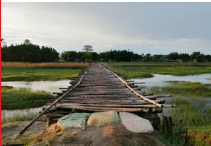
Temporary bamboo bridge used to reach school