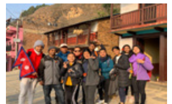
A day out to Bandipur for Parish youths