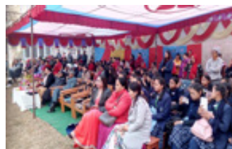
Sports day for SBK students