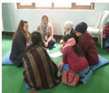
Couples for Christ meet

The regular catechism classes in the church have resumed after the winter vacation in the schools. As final term approaching in most of the schools the church has organized with the help of the Vincent De Paul group of the church to help out evening study hour and tuition classes for all the neighboring students of the church. The church has appointed 12th grade and graduate students of the parish youths to help out in the study hour and tuition classes in the evening for one and half hour daily in the church. The study hour and tuition help are rendered to all the neighboring students of the church irrespective of being Catholics or Christians. We hope this will benefit children of Laborers and uneducated parents.