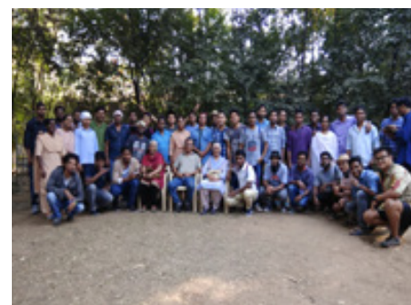
Students of St. Xavier's College, Ahmadabad on tour