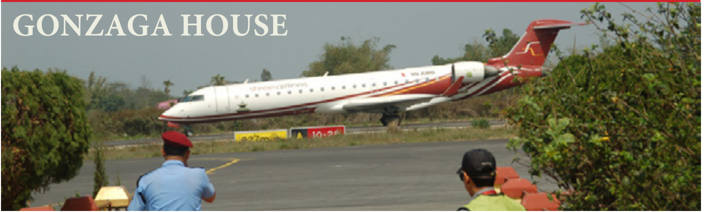
Shree airlines by which Fr. General reached Jhapa mission