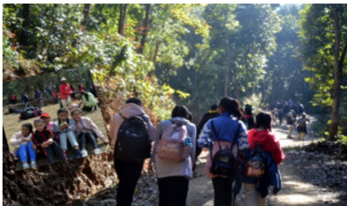
Students hiking to neighbouring hills

One-day Educational Tour was organized for various classes to visit historical places in the valley like Bhaktapur, Darbar Square, Pashupati and Baudha respectively. We also had a one-day hiking for all the students to five different places.