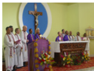
Eucharist celebration at St. Xavier's church