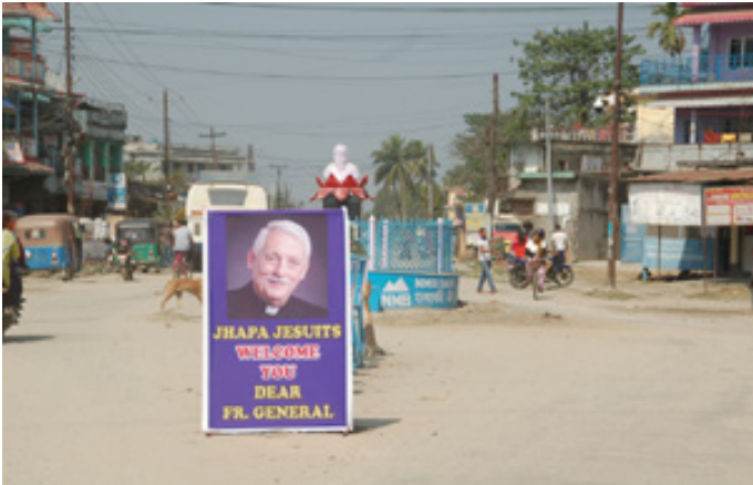
Welcome board at Lekhnath chowk, Chandragadi

Parish work goes on well in spite of little confusion among the faithful. The faithful is getting mixed up with school and parish and the way church functions. Few attempts to orient them is not enough, we need to give them regular orientation and guidance. Their understanding of the Church is like any political entity. Few faithful are politically motivated and want the church to function according