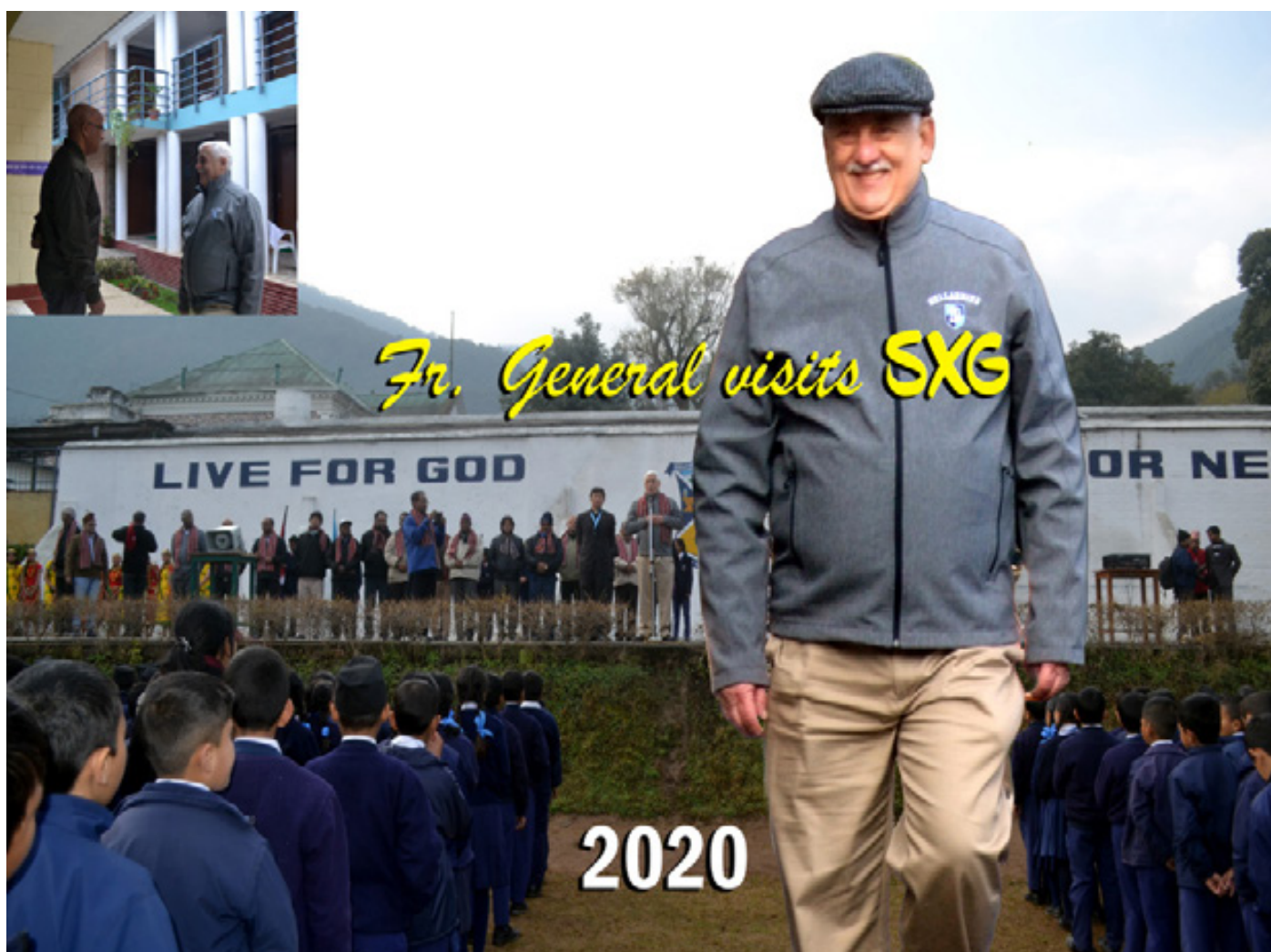
Students of St. Xavier’s School Godavari welcome Fr. General