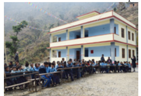
Shree Robang Basic School