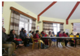
Seminar on child right protection