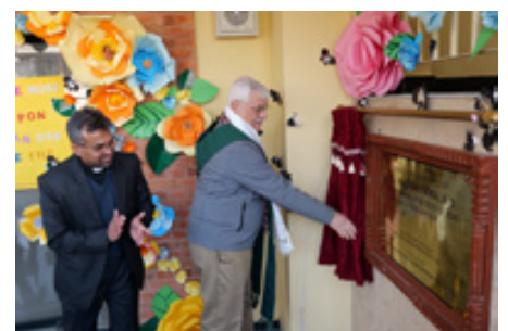
Fr. General unveils the plaque