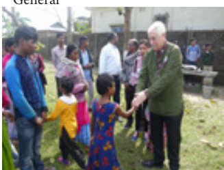
Fr. General interacts with parish children and youths