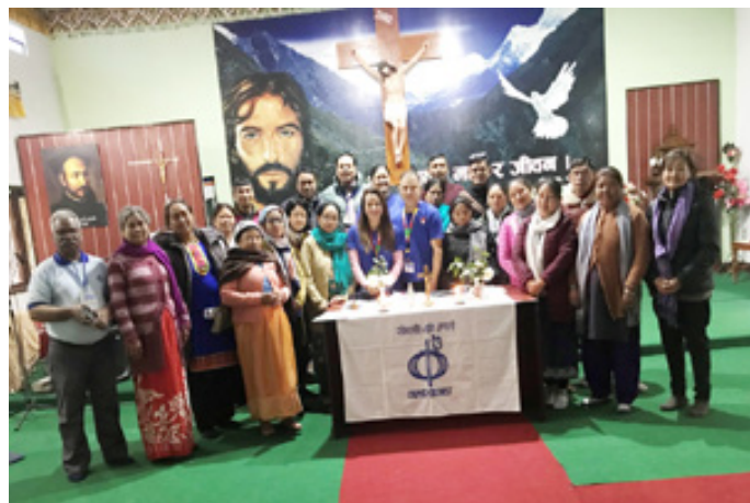
Group photo of couples for Christ