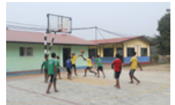
Fr. Moran Day celebration