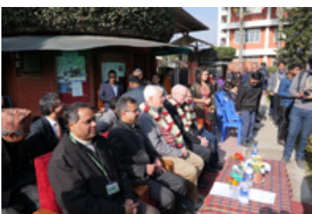
Students entertain Fr. General with cultural show