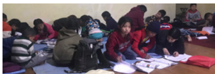
Special tuition for neighborhood students by parish youths