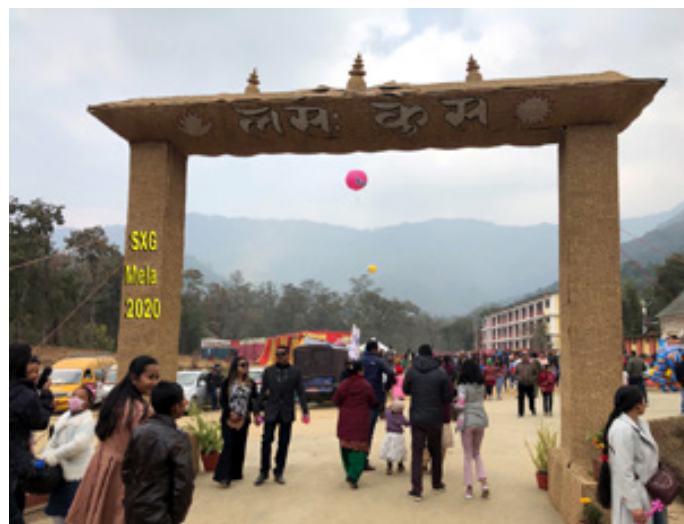
Straw gate made for school funfair