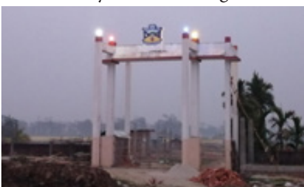
New logo of school at Sadakbari