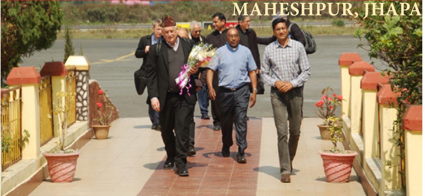
Jhapa Jesuits receive Fr. General at Bhadrapur airport