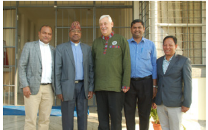
Three Principals and a Parish Priest with Fr. General