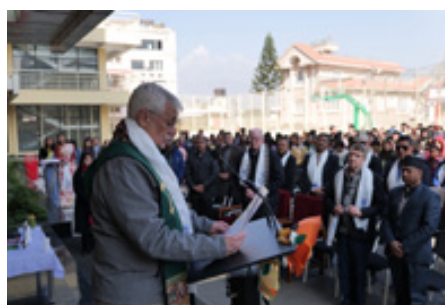
Prayer for blessing of new college building.