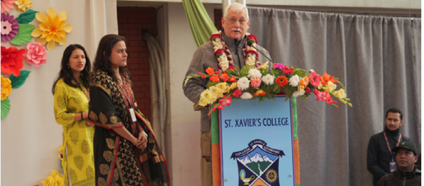
Fr. General addressing the college students at St. Xavier's College, Maitighar, Kathmandu

February saw the culmination of many major activities as we approached the end of the academic year. We began the month with the 7th Cycle Rally with the theme 'ride against cancer' organized by the SET Council. The 25th SET exhibition was the other major event that saw the entire campus filled with more than 100 stalls of projects and exhibitions and thousands of visitors.