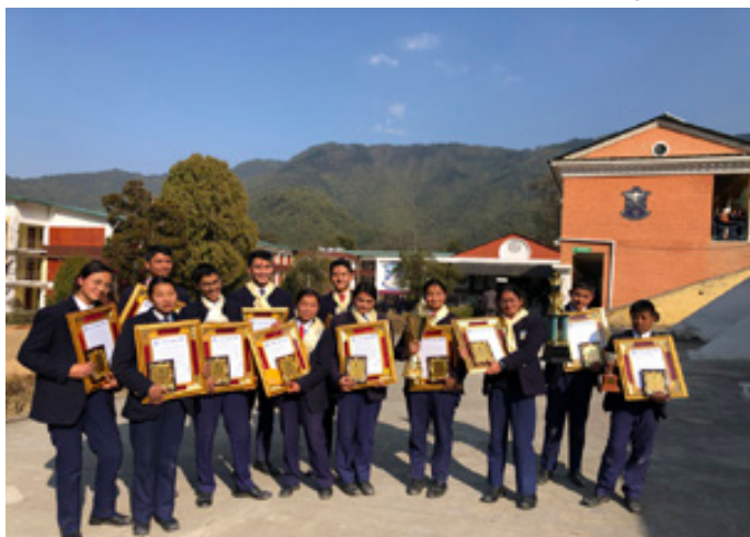
Recipients of Annual School Award

Annual School Award Ceremony was an important event of the year. On Feb. 10th Team of the Year declaration and award distribution were announced. The students could see their mirror images of their performances. "TIGER" was the best team of the year. The school captains were chosen. The outstanding awards