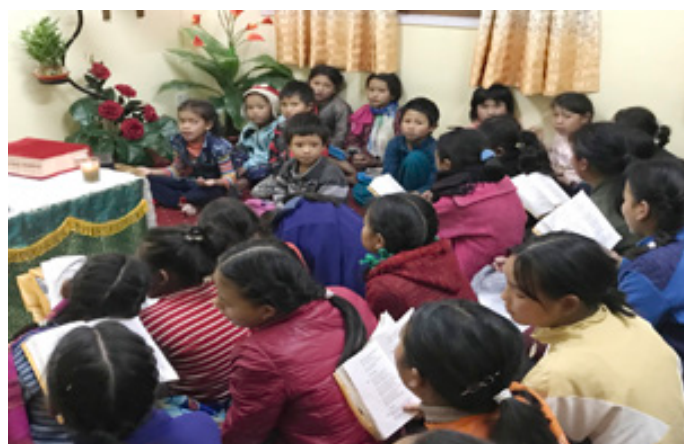
Eucharist in Prernalaya hostel