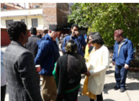
Fr. General interacting with inmates of Social Service center and Aruna Bhavan girls' home