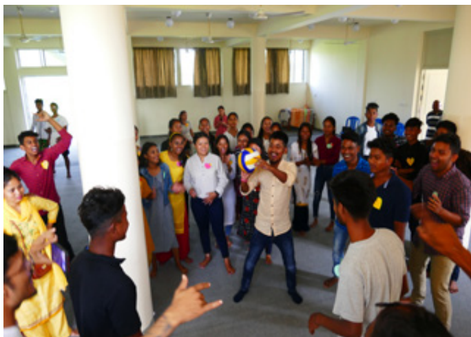
PARISH AND COMMUNITY