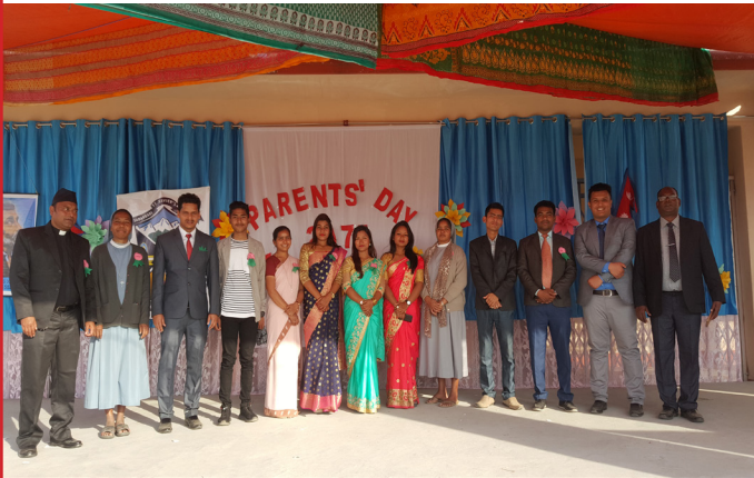
Teaching staff of SXS