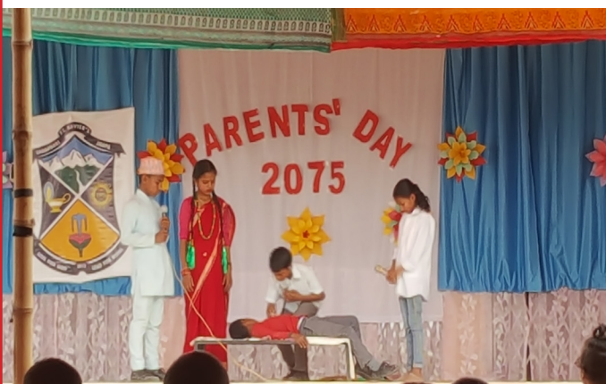
Children performing a skit