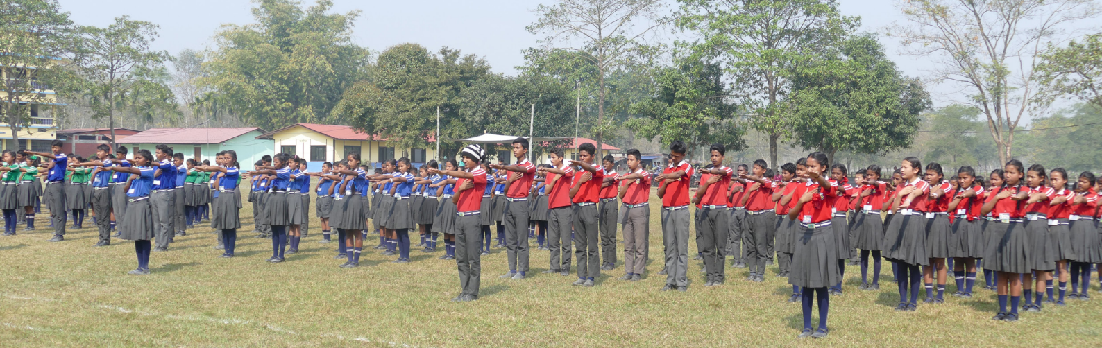
Moran Memorial students celebrate Sports Day