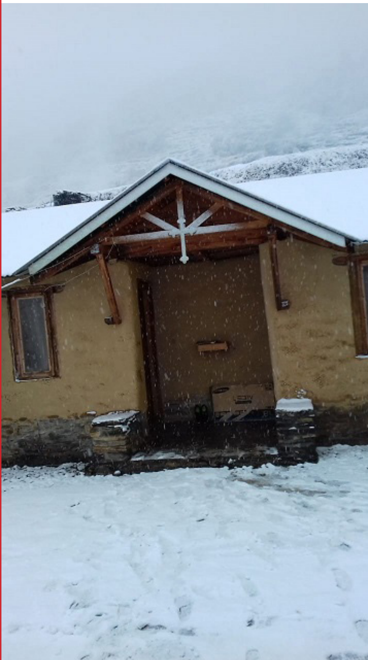
Snow covered Jesuit House