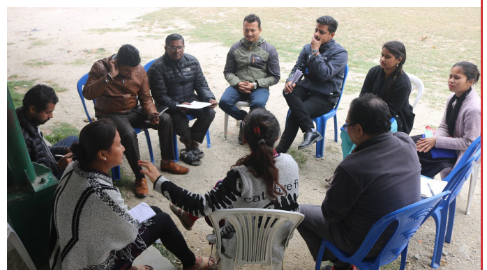
Teachers involved in evaluation and planning