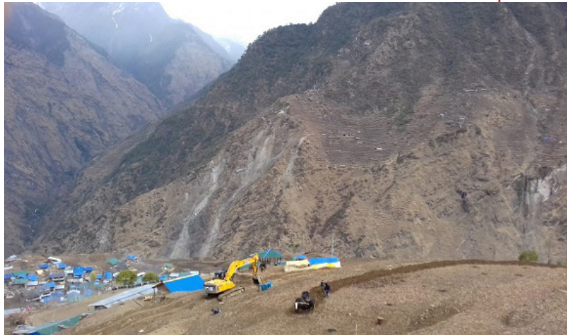
NJSI JCB constructing a road in Ruby Valley

The new road has reached Tipling village and to Airon. The dozer crew is currently putting the finishing touch on the road, in and around the community and wherever needed. Diesel for the dozer in the meantime has to be brought in by mules; the