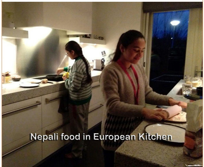
Nepali food in European Kitchen

Tour. They had several group discussions with the students there on current social issues. The students lived in host families and also prepared Nepali Food & Recipes in European Kitchen. They had wonderful experience there. On Jan. 22nd our students were back from Netherland